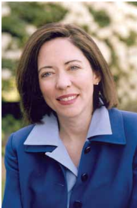
U.S. Sen. Maria Cantwell (D-Wash.) fought long and hard against opposition in her own party in 2010, in an attempt to pass her amendment, co-sponsored by John McCain (R-Ariz.), to restore Glass-Steagall. Ultimately, Obama doublecrossed her.

Wall Street was not happy with FDR's credit program, nor with Glass-Steagall. The bankers correctly saw both as infringements upon their freedom to control people's lives through their control of money, and they roundly condemned the President as a “traitor to his class.” FDR proudly revelled in their hatred, because his allegiance was to the American people, and to the historical tradition of the U.S. credit system which his ancestor Isaac Roosevelt had collaborated with Treasury Secretary Alexander Hamilton to create.