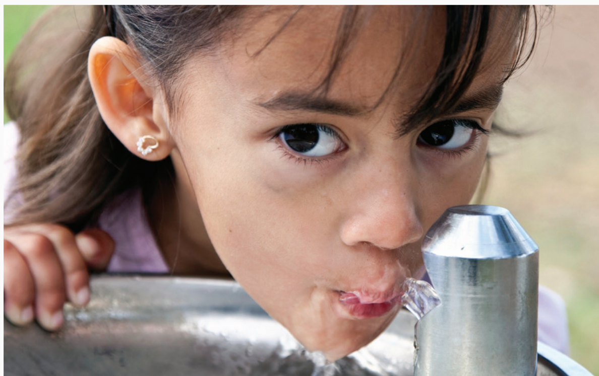
PHOTO: Public water systems are a backbone to a healthy and economically prosperous society.

systems. The report does so by building on New Jersey state lobbying reports, Congressional records, documents gathered through Missouri's Sunshine Law, case studies, and other materials, as well as the expertise of the Public Services International Research Unit (PSIRU). It reviews the track record of public water, explaining why it is too important to delegate; discusses water PPPs as a euphemism for privatization; exposes the false promises of the private water industry and reveals its true costs to cities and communities; examines cases of political interference, ranging from corruption to lobbying to misleading marketing at every level of government; offers alternatives to privatization; and recommends steps public officials can take to strengthen the democratic governance and sustainability of public water systems.