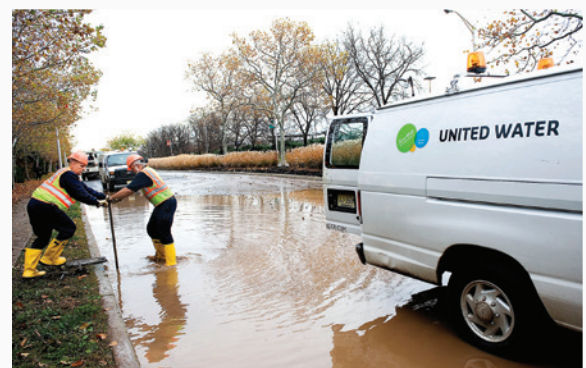
PHOTO: A 12-inch water main break in the water system of Secaucus, N.J., managed by Suez’s United Water. Private water corporations have historically shied away from investing in water infrastructure, and many currently privatized systems face significant need for infrastructure repair that continues to go unmet.

China: The urban sewage connection rate in China rose from 48 percent in 1990 to 74 percent in 2010. 77 Public spending on infrastructure has not only kept pace with the growth of the Chinese economy, it has increased twice as fast: “Since 1995, China’s GDP has almost tripled while overall annual municipal infrastructure spending, including roads, has increased six-fold.” 78 The total length of urban sewage networks increased by nearly 225 percent between 1991 and 1998. However, a World Bank report found that less than 4 percent of all the investment in water and sanitation was financed through the private sector. 79