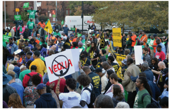
PHOTO: Hundreds of people gather at a rally in front of Baltimore's City Hall. Community organizations, labor unions, and racial justice groups were among those challenging a potential contract between Veolia and the city of Baltimore.

The empirical evidence on the performance and conduct of private water corporations like Veolia and Suez in the U.S. and globally shows that water privatization and PPPs are not the solution—they are a problem. The misleading PR campaign of the private water industry threatens the democratic governance and sustainable management of public water systems. This state of affairs warrants a reconsideration of the appropriate forums and methods for the adoption of public policy regarding our public water systems, as well as a reappraisal of the merits of both the private and the public sectors. It also demands that public officials ensure that public water systems are developed in the public interest, not the interest of private water corporations. In order to achieve sustainable development objectives that are strategically important