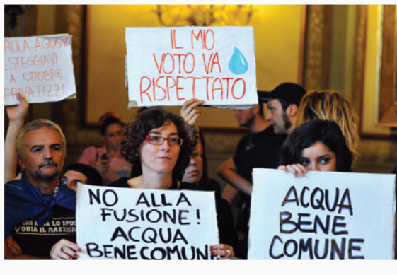
PHOTO: Proponents of public water pack a city council meeting in Bologna, Italy in 2012.