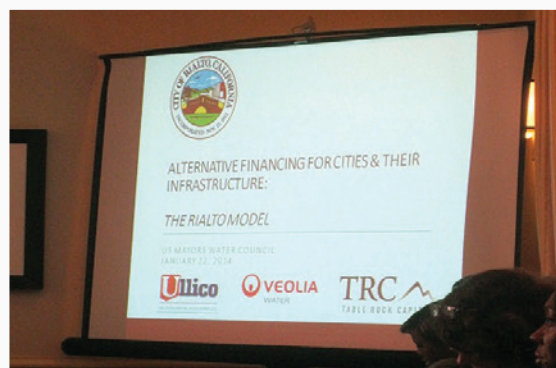
PHOTO: At the U.S. Conference of Mayor's Water Council meeting in January 2014, Veolia highlighted its contract in Rialto, California. City officials received a large upfront payment in exchange for privatizing the water system, which has ended up costing local ratepayers millions of dollars each year. Such upfront payments used to secure contracts have proved so problematic in France that they have been outlawed.

In the U.S. and internationally, the private water industry uses upfront payments to distort the decision-making process and attract municipalities to signing long-term privatization contracts. The private water industry typically structures contracts so that rate increases extend over many years. The industry, including Veolia and Suez, then markets these PPPs as “successes” to other cities and changes the way some public officials think about how water should be governed before the real costs and outcomes of the PPPs come to fruition.