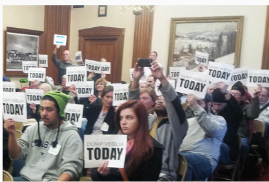
PHOTO: Scores of St. Louis residents pack a Board of Estimate and Apportionment meeting to express their outrage at a proposed Veolia contract. Public outcry stalled the vote necessary to move the contract forward.

In 2007, St. Louis Mayor Slay accepted the first place award and a check for $15,000 from Veolia, for a “Best Tasting City Water in America” award. 193 Three years later, in September 2010, representatives from Veolia toured the St. Louis Water Division facility, leading to an article in one of the city’s largest newspapers and prompting St. Louis city officials to deny rumors that the city’s water system might be privatized.