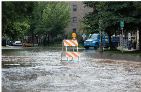
PHOTO: A water main break in Chicago. Water systems across the country are in serious need of infrastructure reinvestment. But findings show that private water contracts including PPPs, rather than being a solution to this crisis, in fact pose substantial economic, legal, and political risk to local officials and the communities they serve.

anti-corruption legislation because upfront payments distorted the decision-making process. Yet, Suez's 2012 contract in Bayonne, New Jersey and Veolia's contract with Rialto, California in the same year have become the corporations' flagships for marketing this model in the United States.