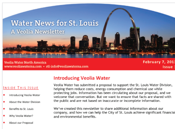
PHOTO: Veolia disseminated PR materials like this newsletter to the St. Louis community and city officials. It was part of the corporation's unsuccessful attempt to undermine public concerns and persuade public officials to move its contract forward. Read more about St. Louis on pages 28-30.

Corporations like United Water claim that water privatization benefits public water systems by allowing water utilities to access the innovation of the private sector, increase the efficiency of operations, share risks, and access private capital. 21 Globally, the false promises of water privatization also include greater private sector efficiency, advanced and innovative technological solutions, high quality services, and private finance for infrastructure development. 22 The private water industry and its supporters promise that all this will help U.S. mayors and other public officials pursue the public interest and strengthen the financial health of their cities. 23 However, both in the U.S. and internationally, the reality of privatized water operations is starkly different from the myths of water privatization.