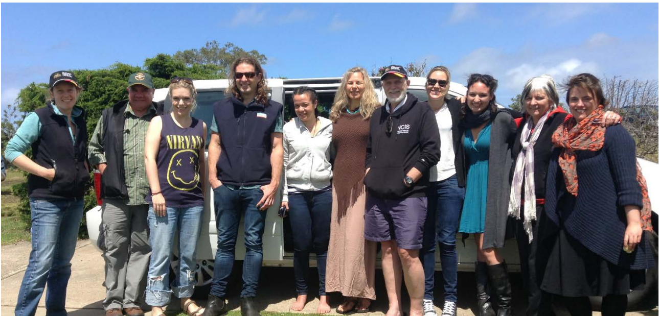
Participants at the 2014 NCIS writing retreat, Kioloa Coastal Campus, NSW.