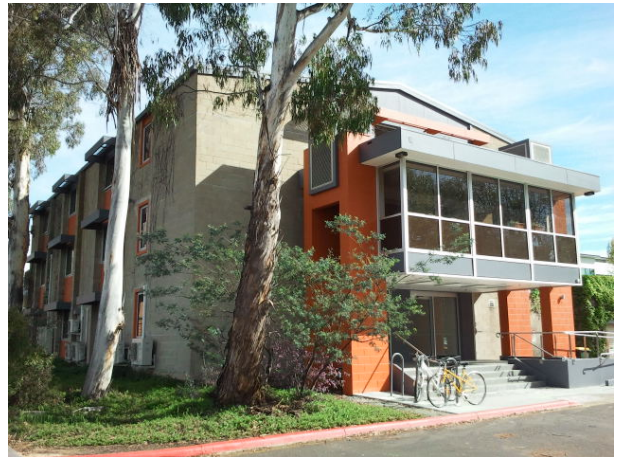
John Yencken Building, 45 Sullivans Creek Road, ANU campus.