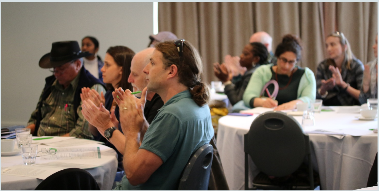
Participants at the 2014 NCIS graduate research retreat, held at the Ibis Styles Canberra Eagle Hawk resort.