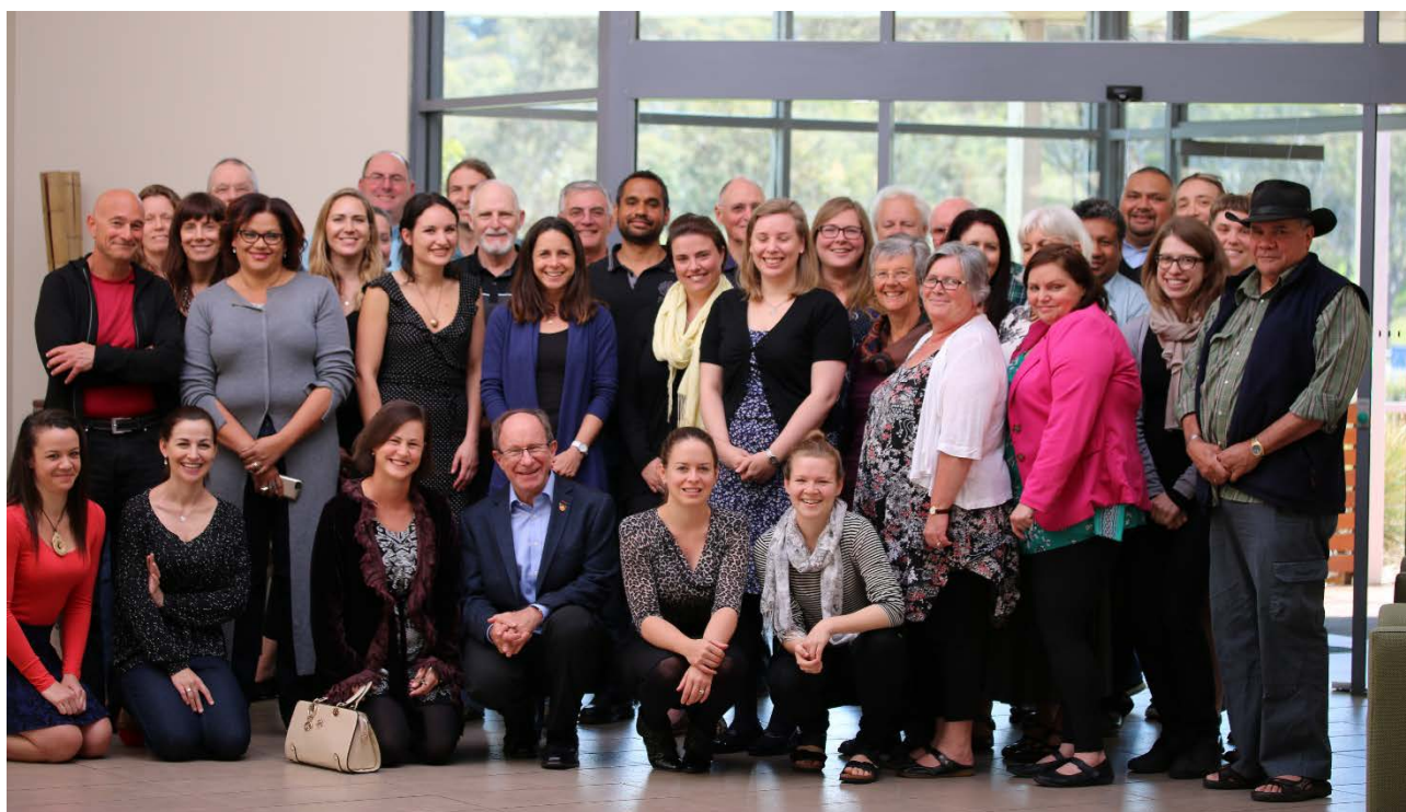
Participants in the 2014 NCIS graduate research retreat.