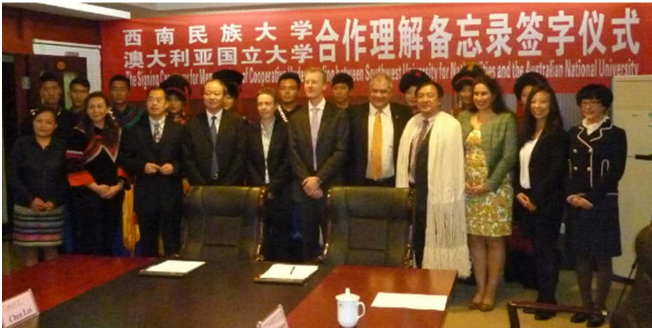
The signing ceremony for the MoU between the South West University of Nationalities and ANU.

NCIS looks forward to deepening its relationship with the Yi Centre at the South West Nationalities University to further scholarship and research between the Centres and the two universities.