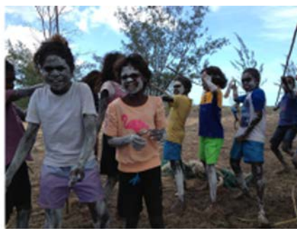
Learning on Country Program : mapping, writing and dancing song-lines (Galiwinku).

The project is significant for Indigenous communities and wider Australian society. A comprehensive assessment of deficit discourse and its influence is of direct relevance to key stakeholders in the Indigenous education system. The project's findings will inform education policy, pedagogy and practice to