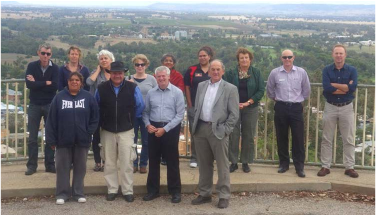
ANU researchers meet Cowra Council representatives and the local Aboriginal Land Council in Cowra on 1 March 2013.

Research on this project was in full swing in 2014. Interviews of young people and service providers in Cowra were carried out between March and July 2014. Preliminary analysis of the data obtained through these discussions was carried out throughout 2014.