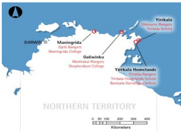
Learning on Country Program evaluation sites: Maningrida, Galiwinku, Yirrkala and Lhanhapy Homelands.

The Learning on Country Program is a cutting-edge approach to education in remote areas where learning is designed to be both relevant and engaging to the local community. The Learning on Country Program aims to incorporate local Indigenous aspirations and perspectives, while simultaneously embedding literacy and numeracy learning in real activities, such as management of environmental threats and pursuit of economic development opportunities. The program links best practice in Indigenous land and sea management and education.