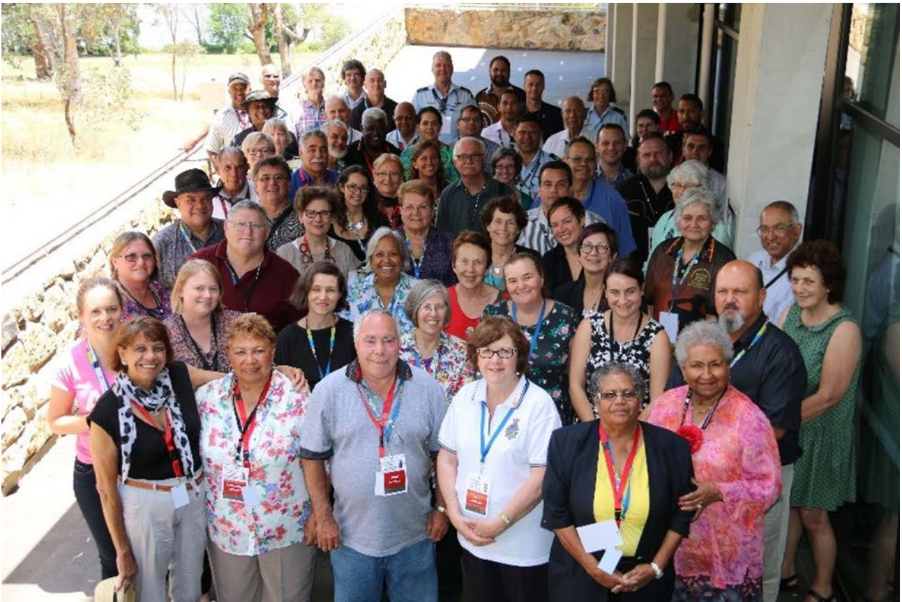
Delegates in the 'Defending Country: Sharing stories of Aboriginal and Torres Strait Islander service' conference, December 2014.