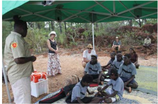
A Yirralka Senior Ranger leading a presentation to students on a field survey of dolphins as part of the Learning on Country Program . The Learning on Country Program is a case study in the Deficit discourse and Indigenous education project.