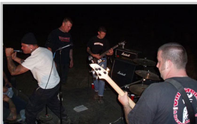
Leaders of Volksfront playing in the white-power band, Jew Slaughter

Southeast Portland, with a particularly active skinhead scene, has served as Volksfront's headquarters since its inception. Soon after its founding, Volksfront's numbers grew to about 50 members in seven cities. During its first few years, Volksfront distributed hate literature in local neighborhoods and cultivated relationships with white supremacist rock bands. In 1998, Volksfront also provided security for Holocaust denier David Irving, who made a stop in Vancouver, Washington, during a speaking tour. Later in 1998, however, Volksfront went temporarily "underground" and shut down its entire operation due to what it described as "internal reasons" and "illegal police and governmental pressure."