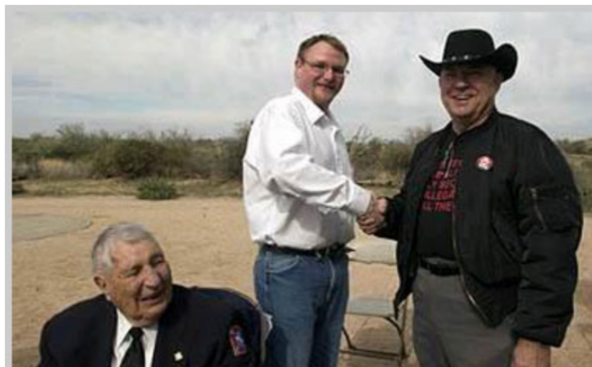
(left to right) Richard Butler of Aryan Nations, Billy Roper of White Revolution and Tom Metzger of White Aryan Resistance at Aryan Fest in 2004

Volksfront is closely associated with the Hammerskins , Aryan Nations , Golden State Skinheads, American Front, Women for Aryan Unity, and Free Your Mind Productions. In addition, white supremacist leaders such as the now-deceased Richard Butler of Aryan Nations , Billy Roper of White Revolution , Tom Metzger of White Aryan Resistance , and attorney Edgar Steele have attended Volksfront gatherings.