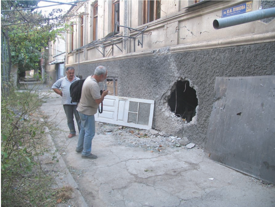
Human Rights Watch examining the basement of an apartment building on Luzhkov Street, in Tskhinvali, which was hit by Georgian tank fire.

Human Rights Watch researchers saw multiple apartment buildings in Tskhinvali hit by tank fire. In some cases, it was clear that the tanks and infantry fighting vehicles fired at close range into basements of buildings. Human Rights Watch interviewed several people who were sheltering in these basements at the time of the attack.