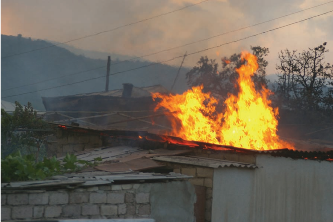
A torched house ablaze in Kekhvi, August 12, 2008.