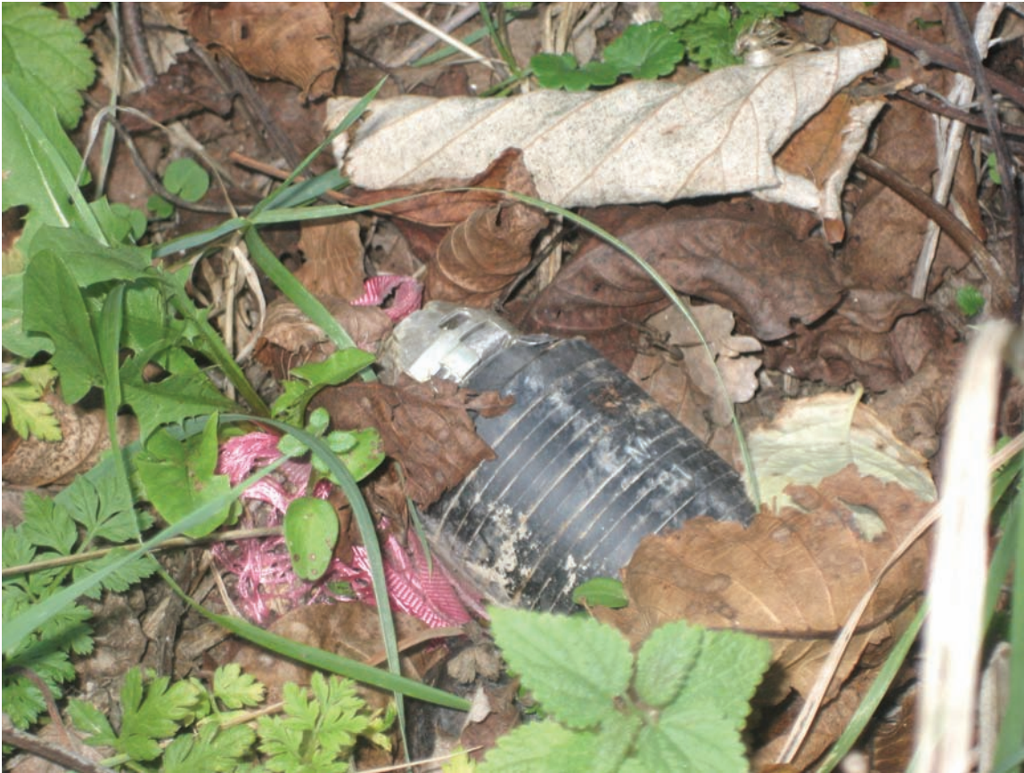
An unexploded M85, an anti-personnel and anti-armor submunition found in Shindisi in October 2008. M85s caused civilian deaths and injuries in Shindisi both at the time of attack and afterwards. Bought from Israel and launched by Georgia, this submunition is carried in an Mk-4 160 mm rocket.

which they brought back to the village. When they tried to disassemble it the submunition exploded, killing Ramaz Arabashvili, age around 40, and wounding four others. 182