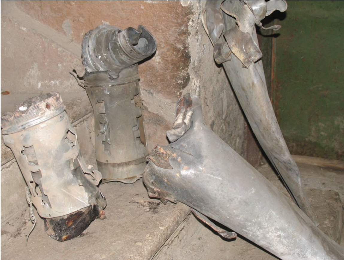
Components of BM-21 Grad rockets recovered in an apartment building in Tskhinvali.

The above are only a few of the examples of damage caused to the South Ossetian capital by Grad attacks.