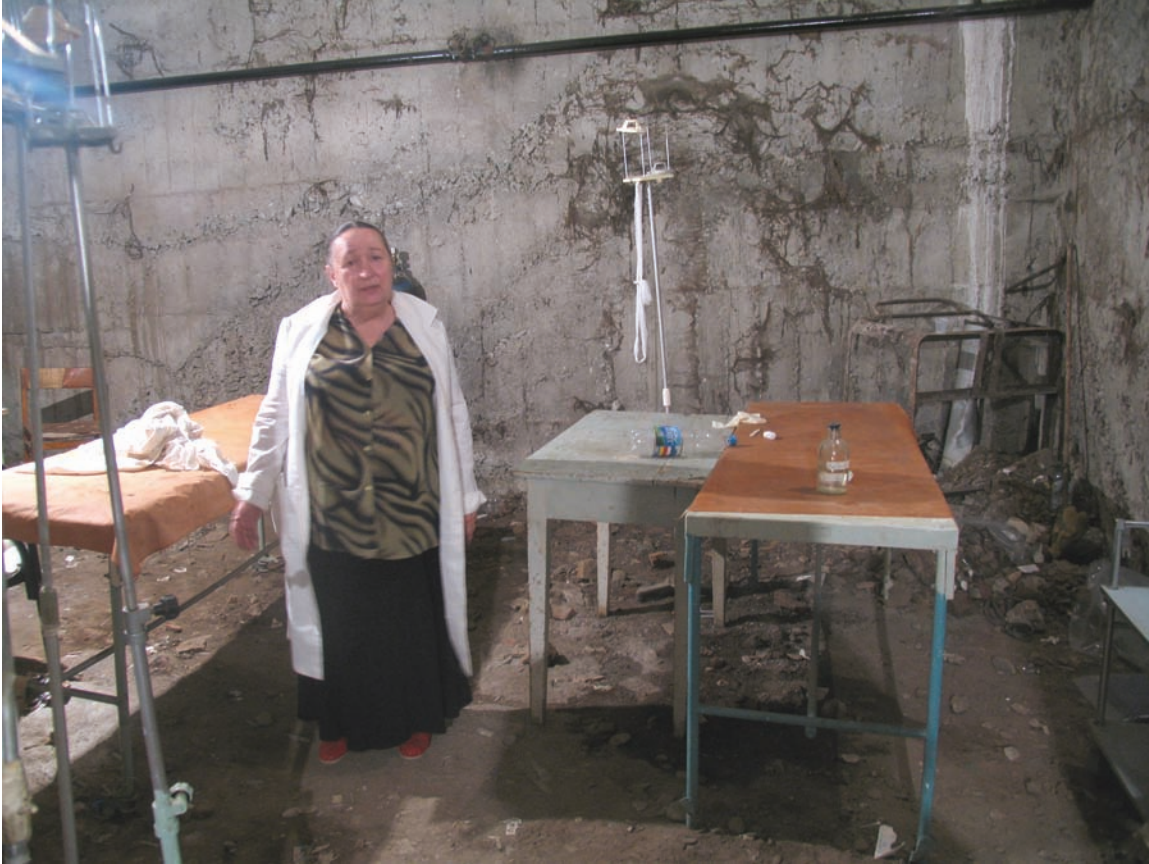
A doctor in the basement of the Tskhinvali hospital where, despite poor lighting and inadequate equipment, medical personnel managed to save, during the fighting, all 273 of their wounded patients.

Hospitals enjoy a status of special protection under humanitarian law beyond their immunity as civilian objects, and the presence of wounded combatants there does not turn them into legitimate targets. 125