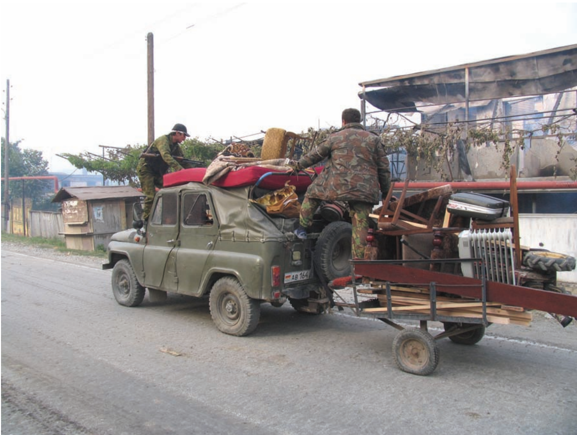
Armed looters take household items from the ethnic Georgian village of Kvemo Achabeti.

On August 12, Human Rights Watch researchers traveling on the TransCam road from Java to Tskhinvali witnessed terrifying scenes of destruction in Kekhvi, Kurta, Zemo Achabeti, Kvemo Achabeti, and Tamarasheni. Dozens of houses had been freshly burned down and remnants of houses and household items were still smoldering. Many other houses were aflame and appeared to have been just torched. Human Rights Watch also saw and photographed Ossetian militias as they moved along the road next to Russian tanks and armored personnel carriers, entered the houses that remained intact, and loaded furniture, rugs, televisions, and other valuables onto their vehicles. Attempting to justify the looters' actions, an Ossetian man traveling on the same road told Human Rights Watch, "Of course, they are entitled to take things from Georgians now—because they lost their own property in Tskhinvali and other places." 362