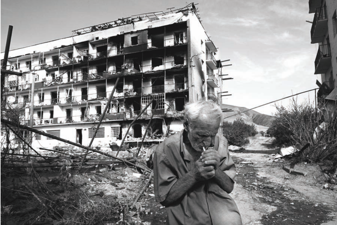
A man stands in front of an apartment building on Sukhishvili Street in Gori, bombed by Russian forces prior to their advance into Gori district.

In some cases in South Ossetia, civilian casualties and damage to civilian property in Georgian villages were caused by artillery shelling. Because both Russian and South Ossetian forces possessed artillery capacity, Human Rights Watch was not always able to establish with certainty whether responsibility for indiscriminate artillery attacks lay with Russian or South Ossetian forces. In these cases further investigation is required to determine specific responsibility for violations of international humanitarian law.