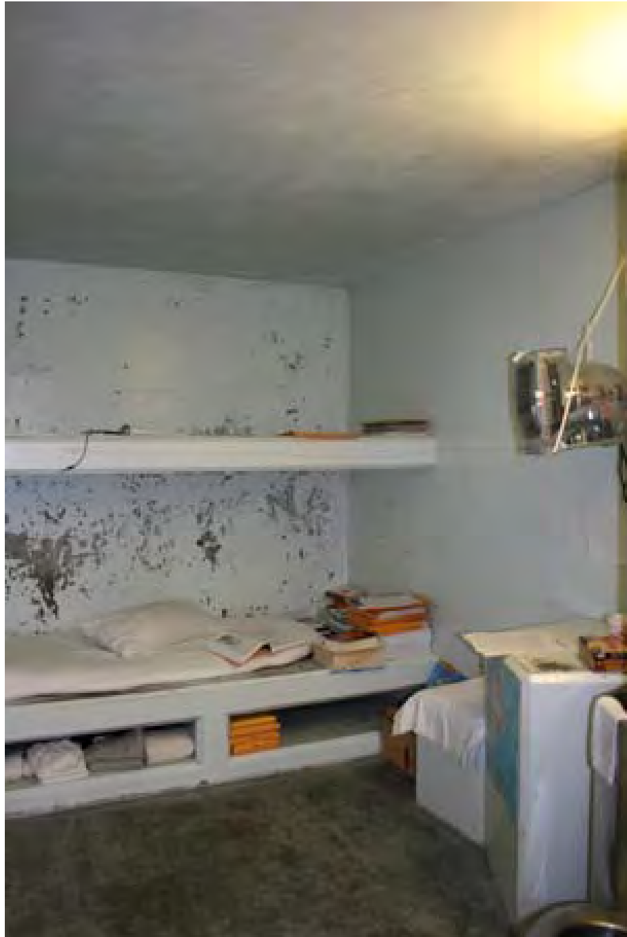
A cell inside Pelican Bay SHU.

The ACA standards also require that “all inmates’ rooms/cells provide access to natural light” and that “segregation housing units provide living standards that approximate those of the general population” in prison. 47