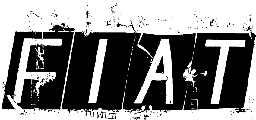
THE REVOLUTION WORKS METHUENICALLY (Karl Marx)