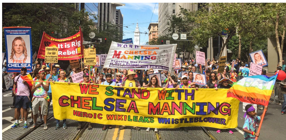
San Francisco Pride Parade Chelsea Manning contingent lead banner, 6/28/2015

I felt that the Iraq and Afghanistan “war diaries” (as they have been dubbed) were vital to the public’s understanding of the two interconnected counter-insurgency conflicts from a real-time and on-the-ground perspective. In the years before these documents were collected, the public likely never had such a complete record of the chaotic nature of modern warfare. Once you come to realize that the co-ordinates in these records represent real places, that the dates are our recent history and that the numbers represent actual human lives—with all of the love, hope, dreams, hate, fear and nightmares with which we all live—then you cannot help but be