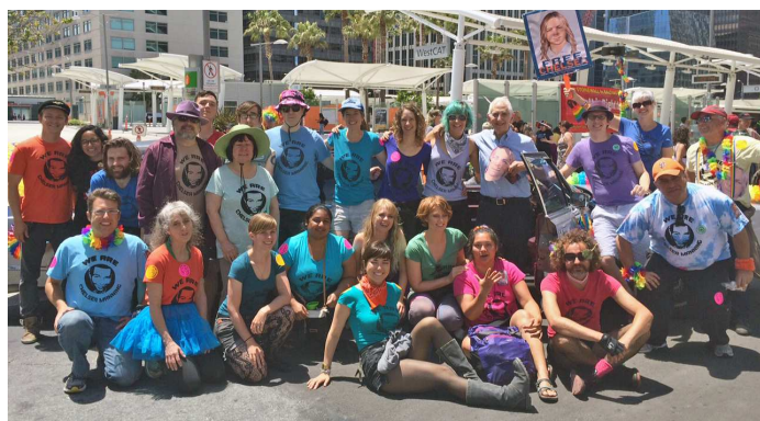
Group photo of the Chelsea Manning Flash Mob Dancers prior to performing in the SF Pride Parade, 6/28/2015

After being transferred back to the US, I was confined at the now-closed military brig at the Marine Corps base in Quantico, Virginia. This time was the most difficult for me overall, and felt like the longest. I was not allowed to have any items in my cell unless I was