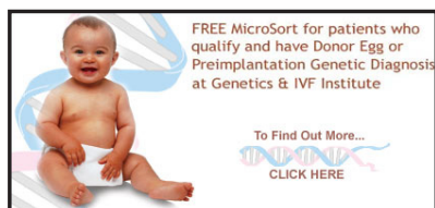
Ads targeting prospective parents

Professional organizations involved in sex selection are the American Society for Reproductive Medicine (ASRM) and the American College of Obstetricians and Gynecologists (ACOG). Ethical opinions and guidelines issued by ASRM and ACOG are voluntary, although these organizations could enforce their rules against their members by taking away their membership or otherwise disciplining them publicly, something they have done very infrequently to date. The ASRM Ethics Committee has published several opinions on sex selection. One opinion focuses on PGD, and states that among infertile patients using IVF for infertility, the addition of PGD solely for sex selection “should not be encouraged” and use of IVF and PGD solely for sex selection where infertility is not an issue “should be discouraged.” 14 The Ethics Committee also recommended that if pre-pregnancy techniques, particularly sperm sorting, were found to be safe and effective, doctors should be able to offer them to couples for family balancing, as long as certain conditions such as informed consent are met. 15 Both guidelines express the concern that sex selection may perpetuate sex discrimination, gender role expectations and stereotypes.