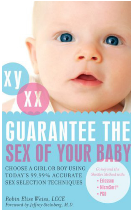
One of several recently-published books capitalizing on consumer interest in sex selection.

constitutional. Recent Supreme Court cases have held that the state may place limits on a woman's right to obtain abortions as long as they are not overly burdensome. Narrowly defined limits, such as 24-hour waiting periods and mandatory sonograms, have passed constitutional muster. The Supreme Court could find that sex selection perpetuates—or is equivalent to—discrimination against women, and that preventing discrimination against women is a legitimate state interest that overrides the right to obtain an abortion.