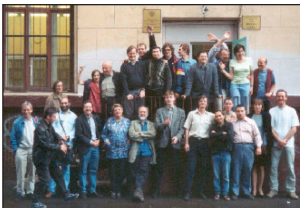
Praxis Conference at the Victor Serge Library, Moscow, 2003

The PRAXIS collective is an association of libertarian socialists, Marxists, syndicalists, and progressive democrats. It grew out of the perestroika and glasnost period of the late 1980s, when activists began to organize openly for democratic change in the USSR. They were on the barricades during the 1991 revolt by Soviet conservatives and, after the defeat of the coup d'etat , began meeting with international activists.