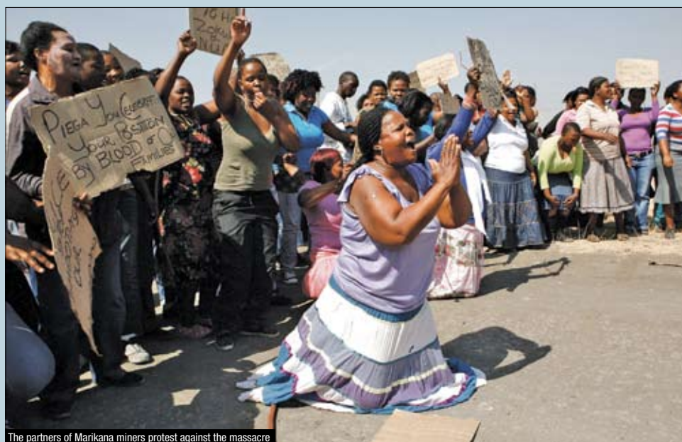
The partners of Marikana miners protest against the massacre