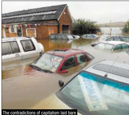
The contradictions of capitalism laid bare