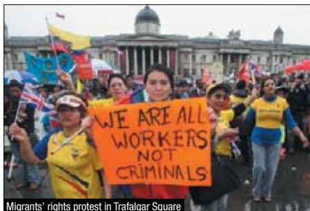
Migrants' rights protest in Trafalgar Square