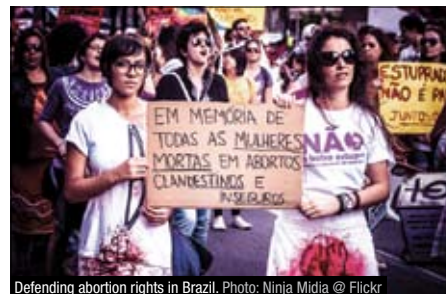
Defending abortion rights in Brazil.