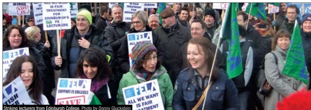
Striking lecturers from Edinburgh College.