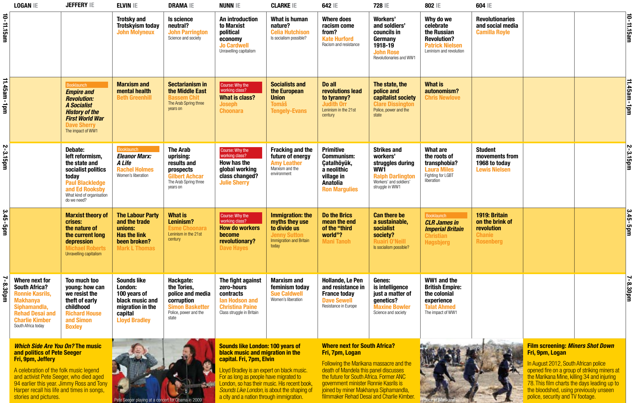
Pete Seeger playing at a concert for Obama in 2009