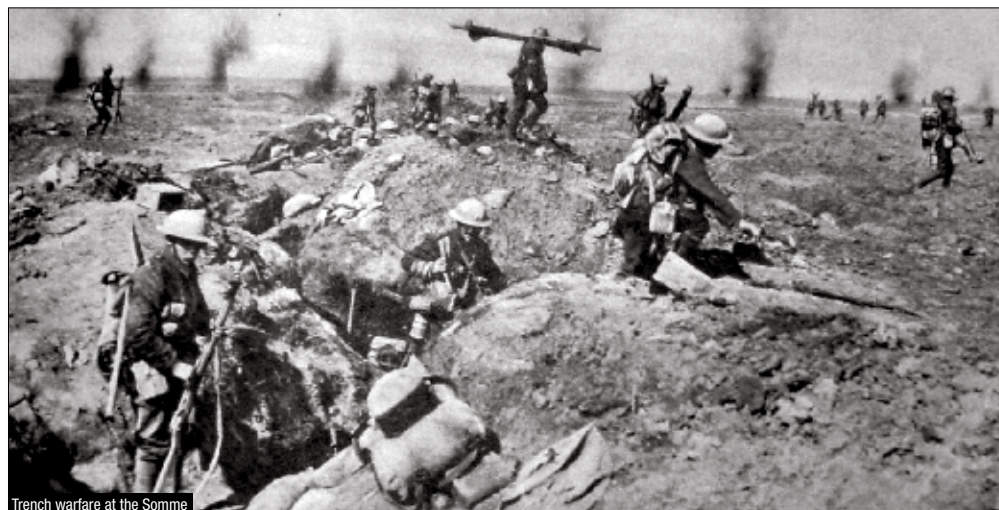
Trench warfare at the Somme