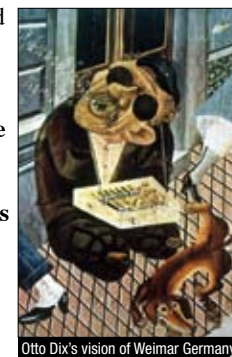
Otto Dix's vision of Weimar Germany