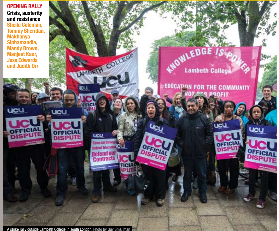
A strike rally outside Lambeth College in south London.