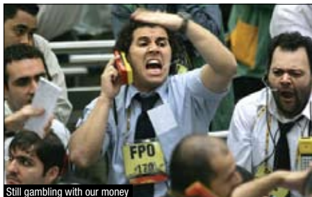
Still gambling with our money