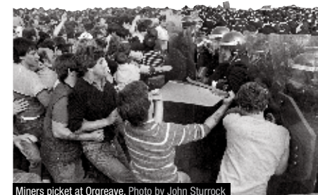
Miners picket at Orgreave. Photo by John Sturrock