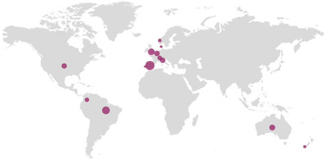
F. 11 CO-OPERATIVES IN THE HEALTH AND SOCIAL CARE SECTOR BY COUNTRY

Data was collected for 53 co-operatives distributed in 12 countries , with a total turnover in 2011 of 20.84 billion US dollars.