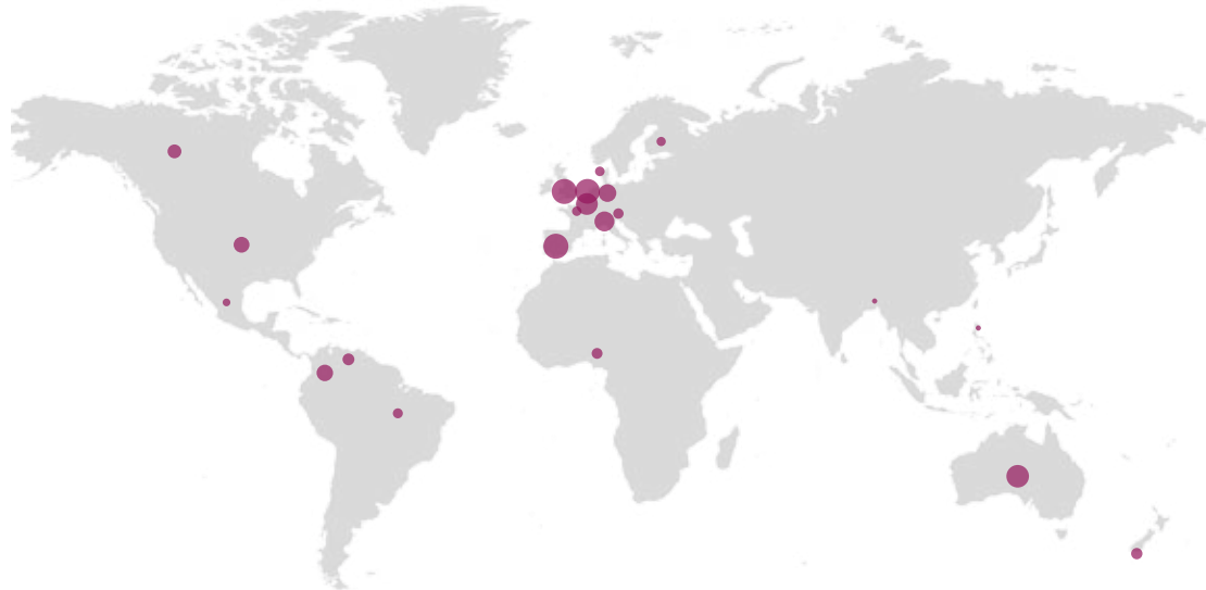
F. 13 CO-OPERATIVES IN THE OTHER SERVICES SECTOR BY COUNTRY

Data was collected for 117 co-operatives distributed in 23 countries , with a total turnover in 2011 of 19.35 billion US dollars.