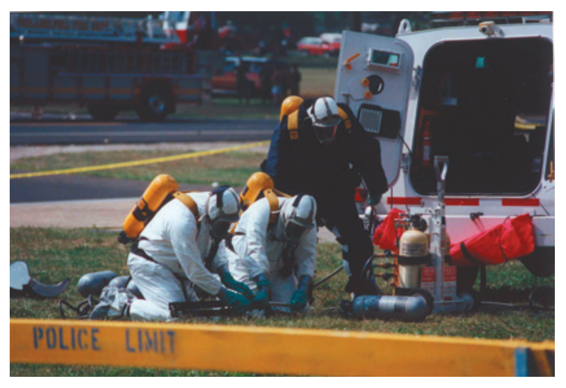
More than 28,000 first responders have been trained by SBCCOM.

bilities that were appropriate in a prior century. We need to think things anew. We need to take steps that are bold and innovative and that will position us so that we can continue to provide peace and stability in the period ahead. And that takes transformation." The Army has changed continually since its birth, but we face an imperative to accelerate our transformation. We must assess our capabilities and look to our people to make it happen.