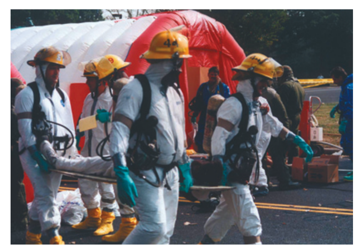
Right and below, firefighters participate in a SBCCOM domestic preparedness exercise.

control workload and standards for items repaired and returned to users at organizational, direct support, and general support levels.