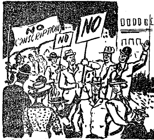
1916-17. NO CONSCRIPTION.