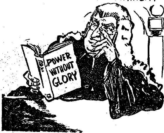
1951. NO THOUGHT CONTROL