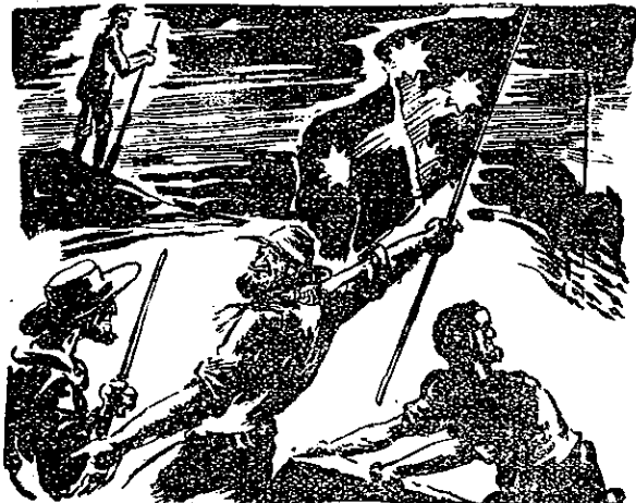
1854. NO LICENCES