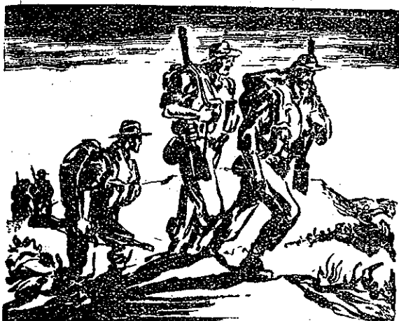
1939-45. NO FASCISM