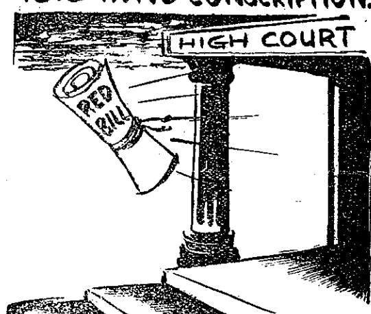
1951. NO POLITICAL BANS.