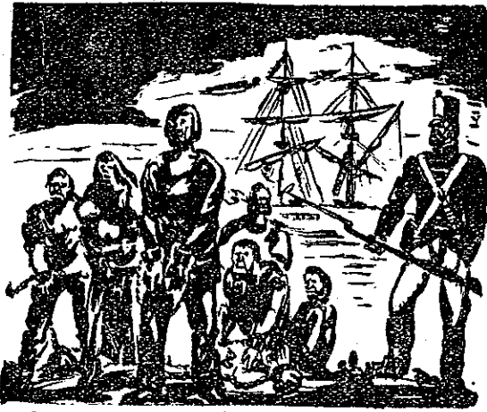
1850. NO CONVICTS