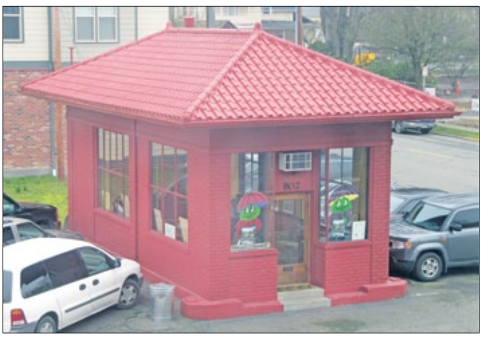
Snohomish Chamber of Commerce office

The Snohomish Chamber is located Street address: 802 First St, Snohomish, WA 98290 Mailing address: P.O. Box 135, Snohomish, WA 98291 www.cityofsnohomish.com • 360-568-2526