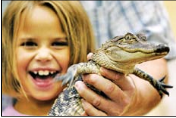
The Reptile Man