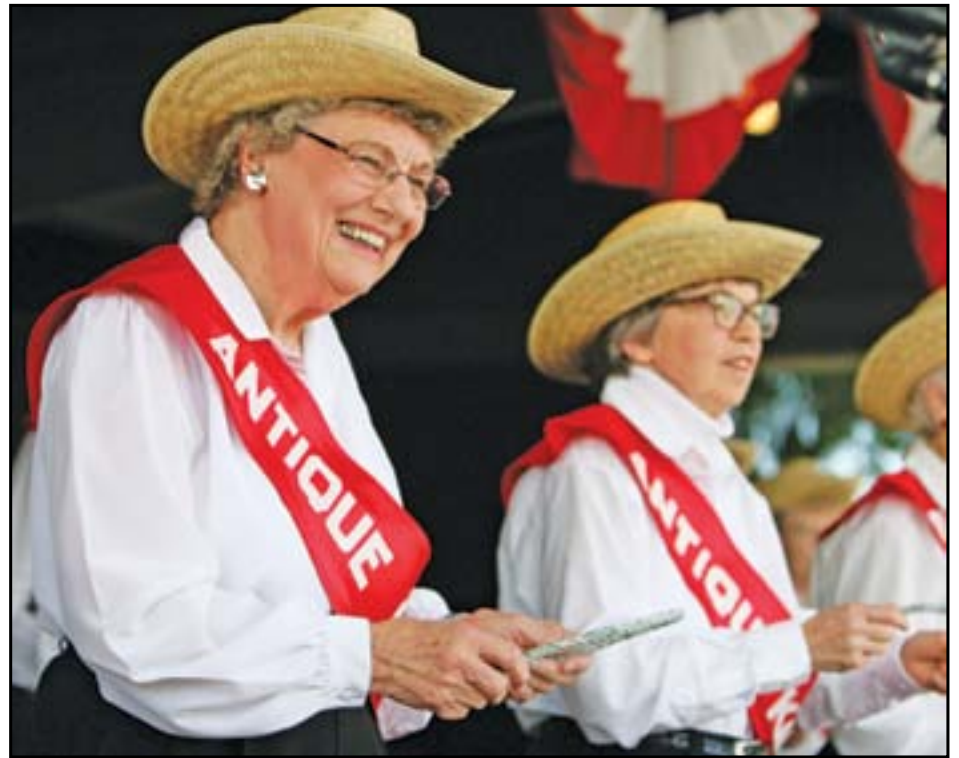
The Antique Kids will perform at 11am.

Grab your friends and make a day of it at the Fair and take advantage of the free gate admission for all seniors 62 plus years of age! You deserve it!