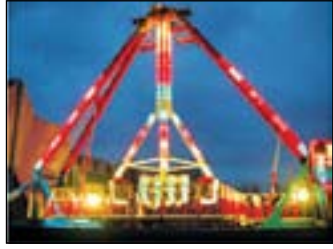
For a thrilling experience try the new ride: Freak Out!

Near the Blue Gate (East) are the Family and Kid rides.