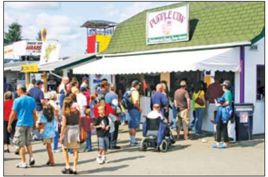
Be sure to visit the Snohomish County Dairy Women's Purple Cow concession stand at the Fair. Every 13th Purple Cow is FREE!