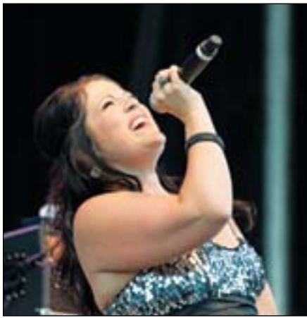
Karaoke semi-finals will be Saturday, Aug. 29 at 7pm. Finals will be Sunday, Aug. 30 at 6:30pm.

continued from previous page (Reptile Show)