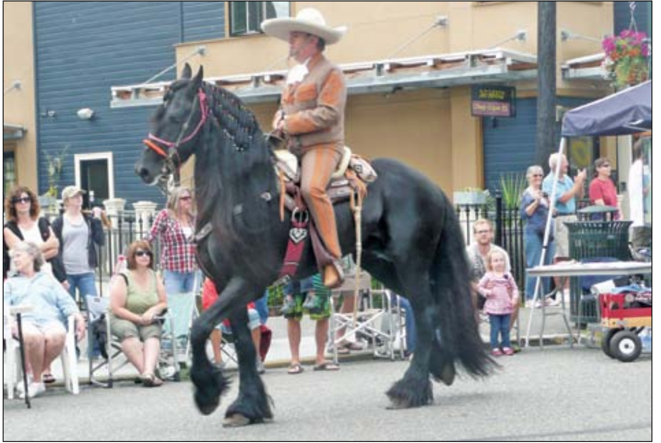
The Ixtapa Equestrian Team is sure to entertain the crowd at the Monroe Fair Days Parade!