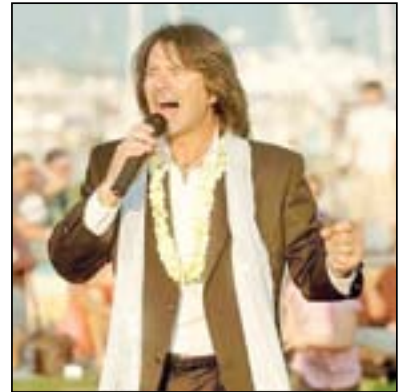
Cherry Cherry, a Neil Diamond tribute band, will perform at 5:45pm.