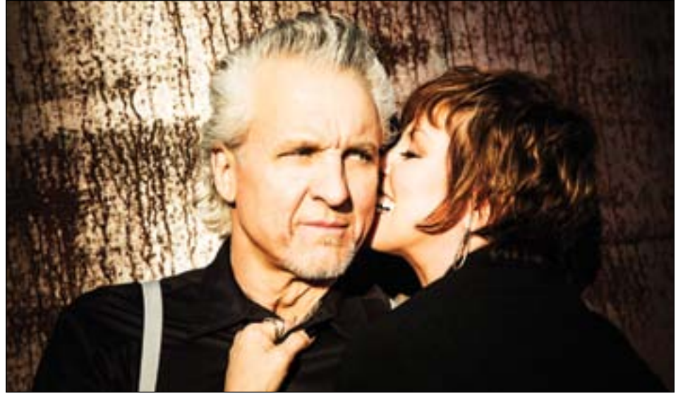
Pat Benatar and Neil Giraldo