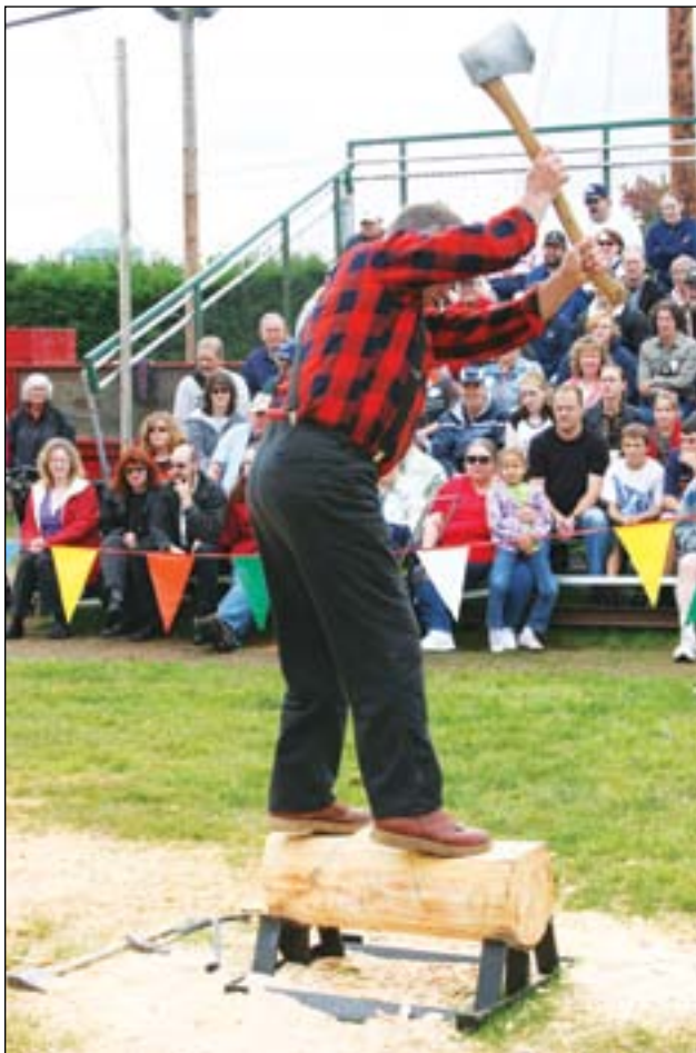
Be sure to catch the International Lumberjack Show during your visit at the Evergreen State Fair.

Advance wristbands are only $25 (valid any day of the Fair!). This is a savings of up to $7. On sale at the Fair Box Office or online at www.evergreenfair.org . Last day to purchase is Wednesday, August 26!