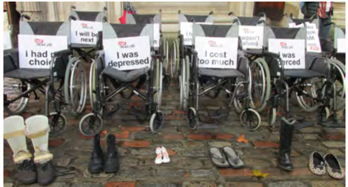
Not Dead Yet