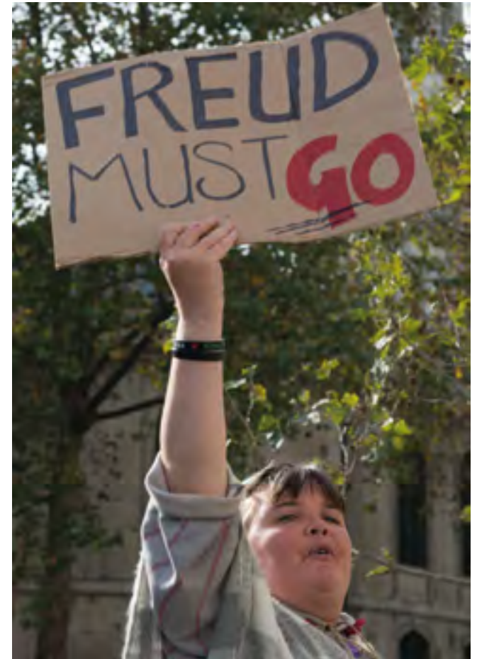
Freud Must Go

104,200 disabled claimants of jobseeker’s allowance were ‘sanctioned’ at least once between October 2012 - 30 September 2013 after the introduction of new rules.