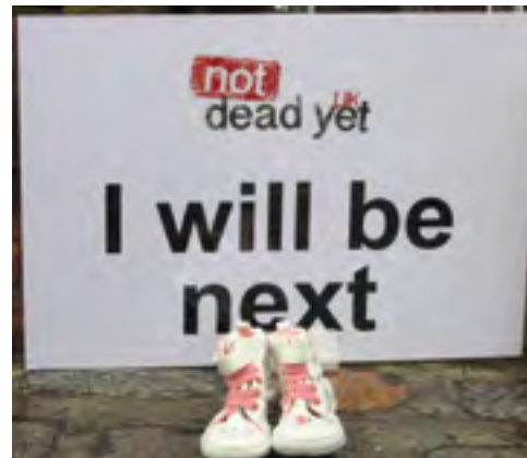
Not Dead Yet