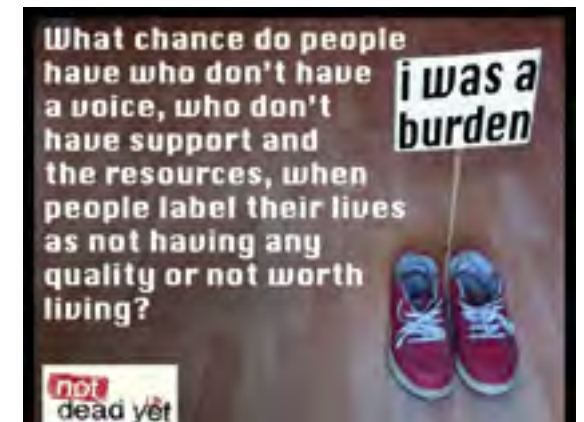
Not Dead Yet