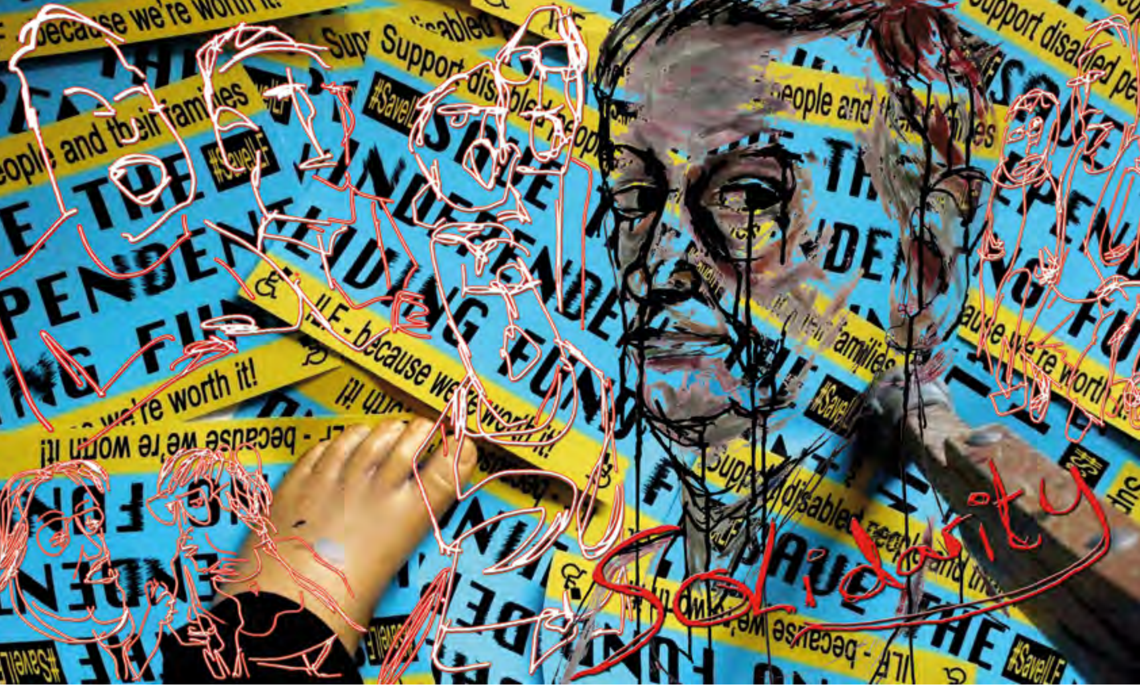
Tanya Raabe — Solidarity: Save ILF