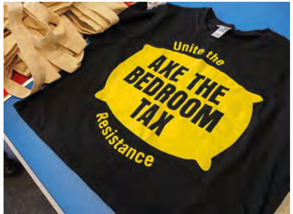
Axe the Bedroom Tax T-Shirt