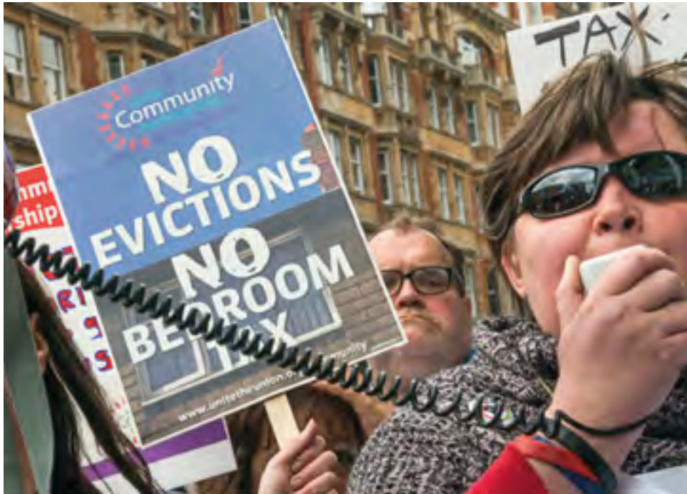
No Bedroom Tax Protest

Two thirds of people hit by the bedroom tax are disabled and a further one in ten is caring for a disabled person.