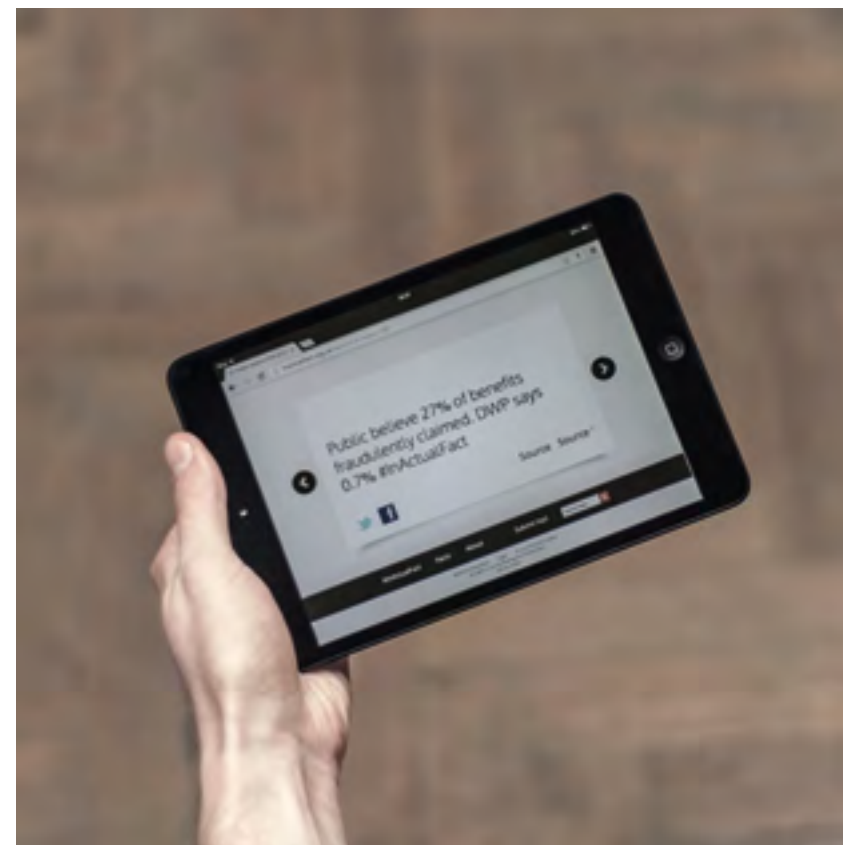
Liz Crowe — In Actual Fact

In contrast to traditional images of disabled people as objects of pity and victims, we have shown disabled people to be capable, organised and determined, not only within our own movement, but at the forefront of the wider anti austerity movement.