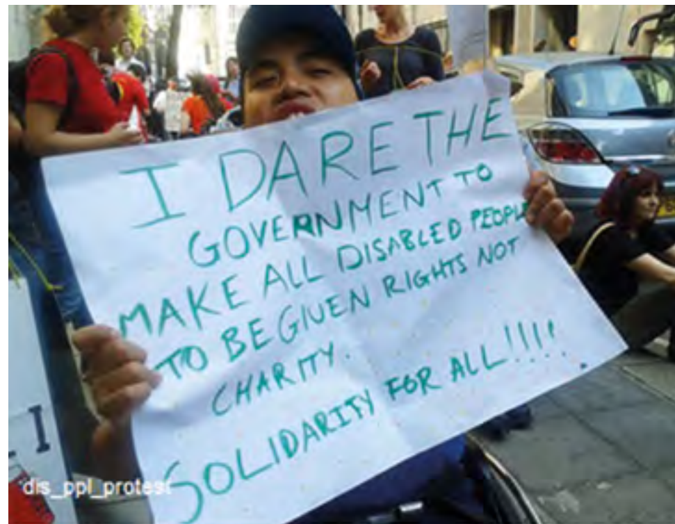
Reclaiming our Futures Protest

Michael Gove Education Performance Report Card.