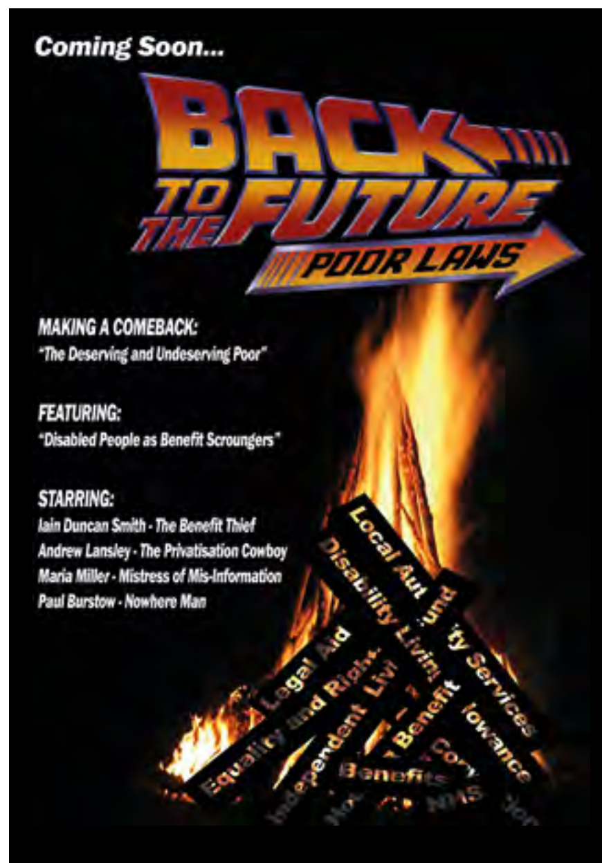
Equal Lives — Back to the Future Poster

Sanctions for Employment and Support Allowance claimants placed in the Work Related Activity increased nearly 580% between March and December 2013.