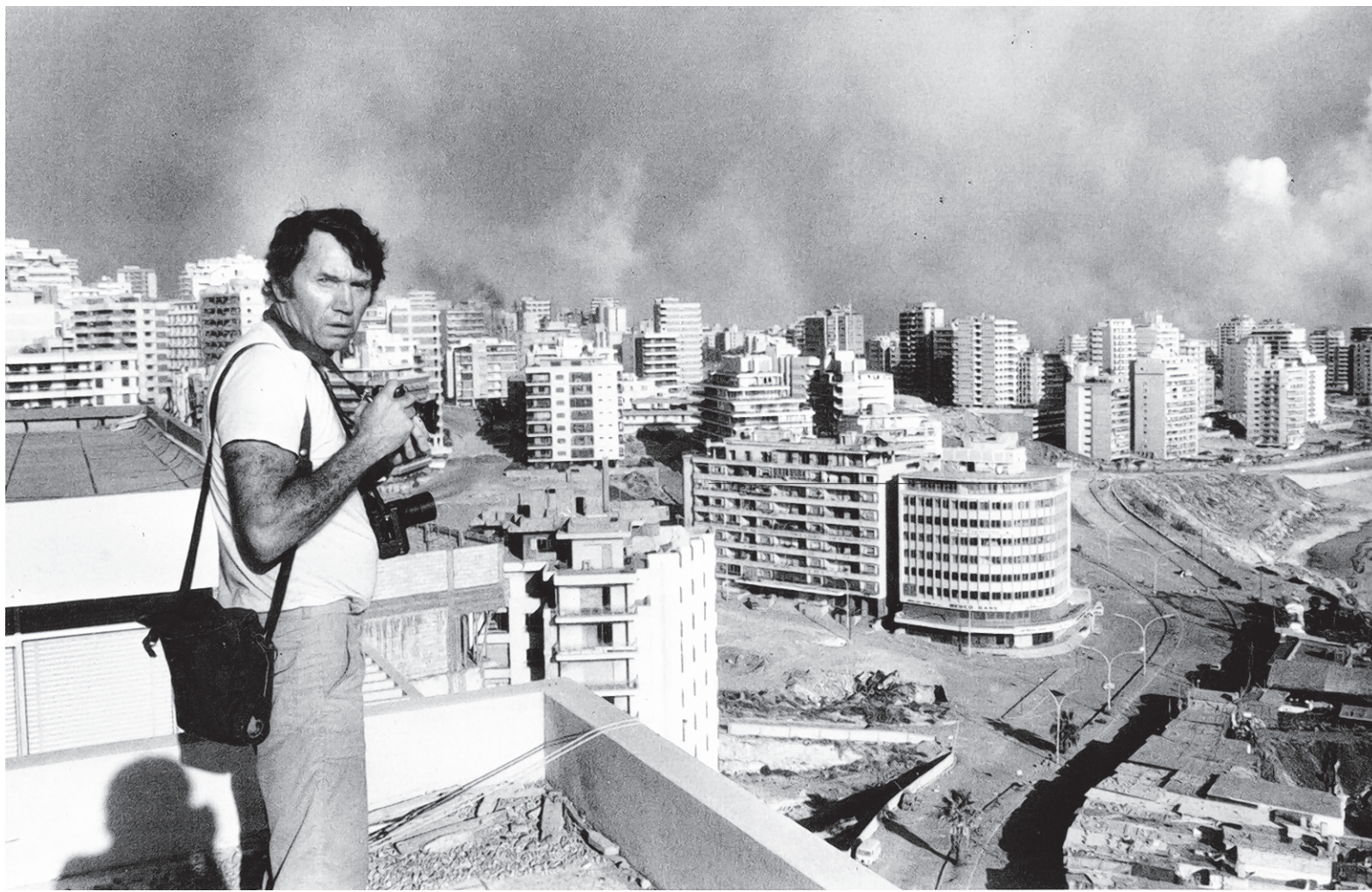
McCullin, Beirut 1982.