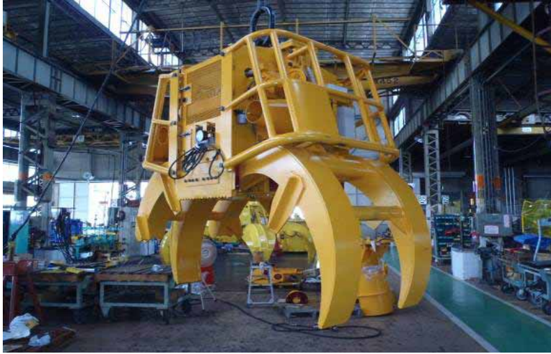
Oil pressure fork lift

Used for grabbing and lifting up and down the steel materials