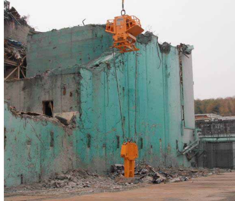
Oil pressure pliers

Used for cutting the roof truss and overhead traveling crane