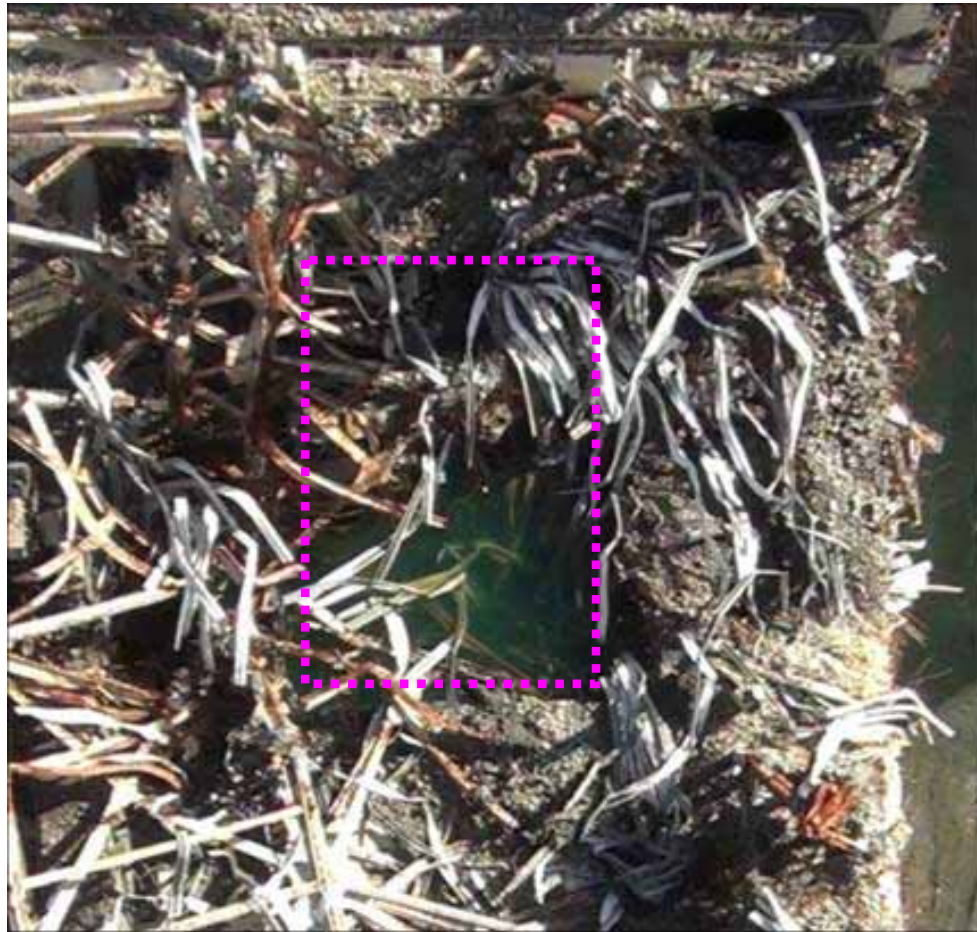
Before debris removal

Photo taken on November 10, 2011 by TEPCO