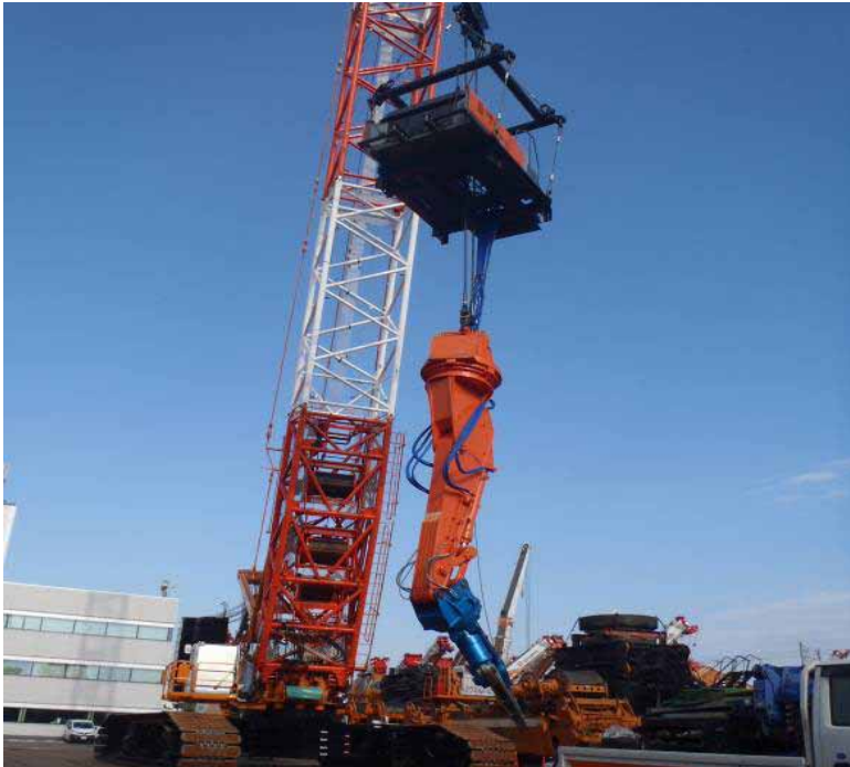
Oil pressure cutter

Used for scooping up the debris on the slabs