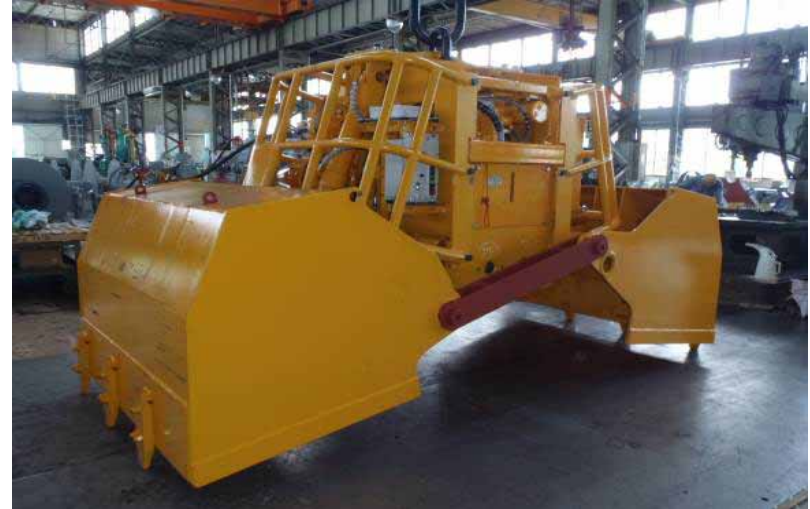
Oil pressure grab bucket

Used for grabbing and lifting up and down the steel materials