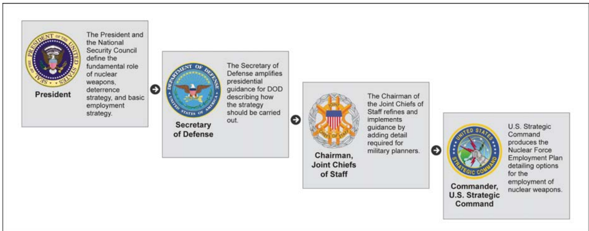
Figure 1: Strategic Nuclear Weapons Targeting Process