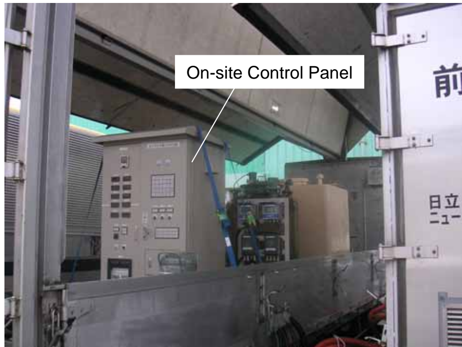
Auxiliary Machine (Control) Unit