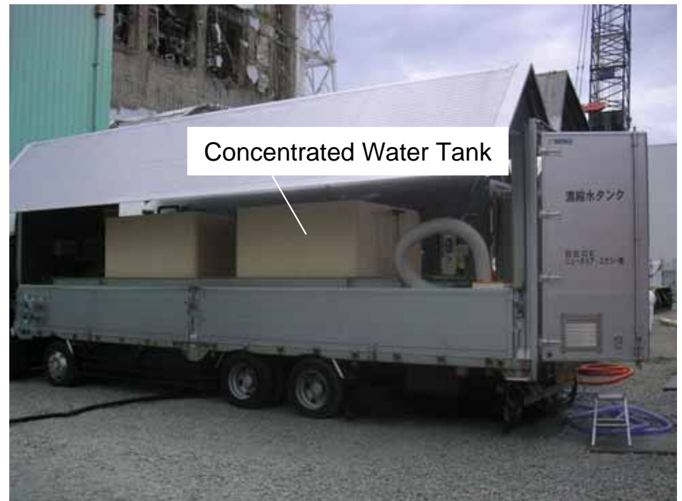
Concentrated Water Tank Unit