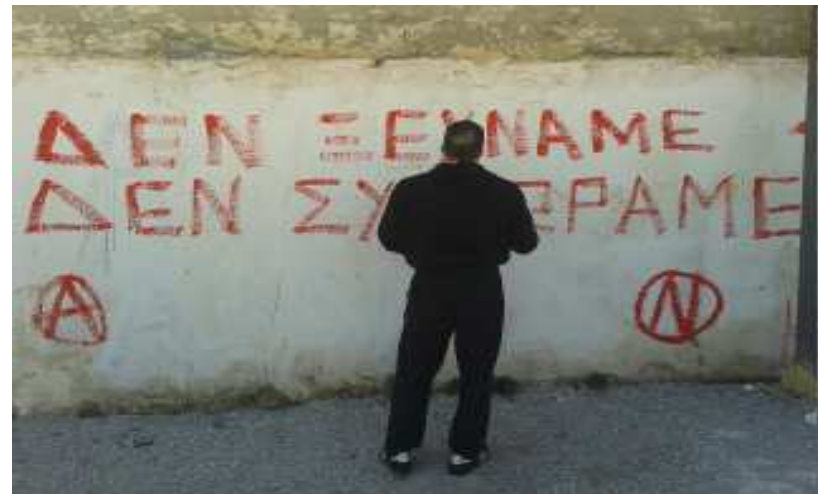
(A) We don't forget, we don't forgive (N)