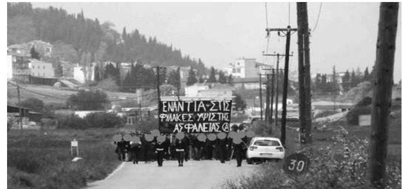
Against maximum security prisons