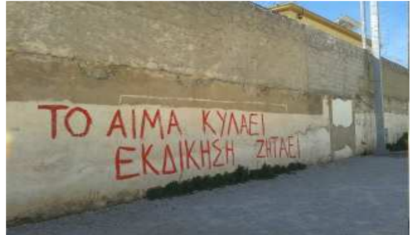
The blood is still flowing seeking revenge