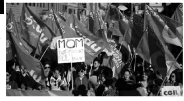
A million Italian workers march in Rome against austerity law.

ready been carried out in Spain. It did boost Spain's exports, but this was made easier for the bosses by the fact that Spain's official unemployment rate was 25 percent and youth unemployment was over 40 percent.