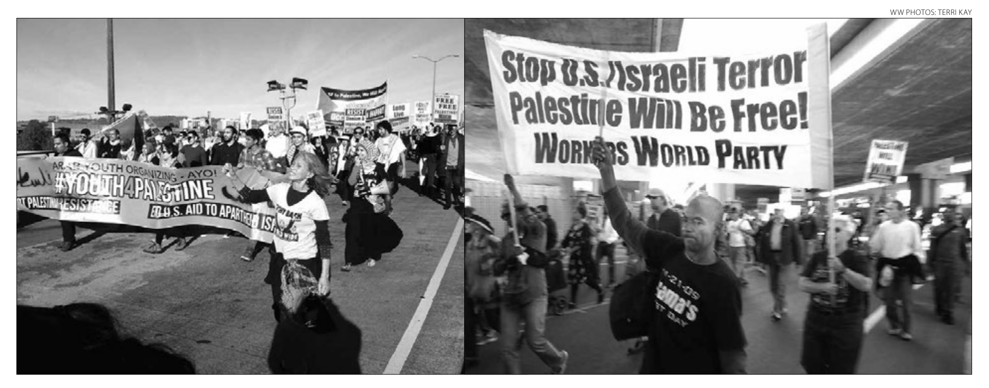
The Block the Boat Coalition marches in solidarity with Palestine. Oakland, Calif.