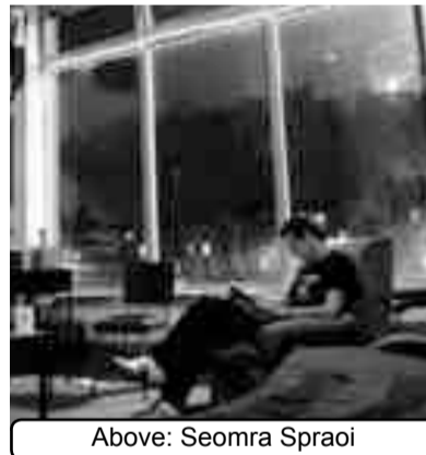
Above: Seomra Spraoi