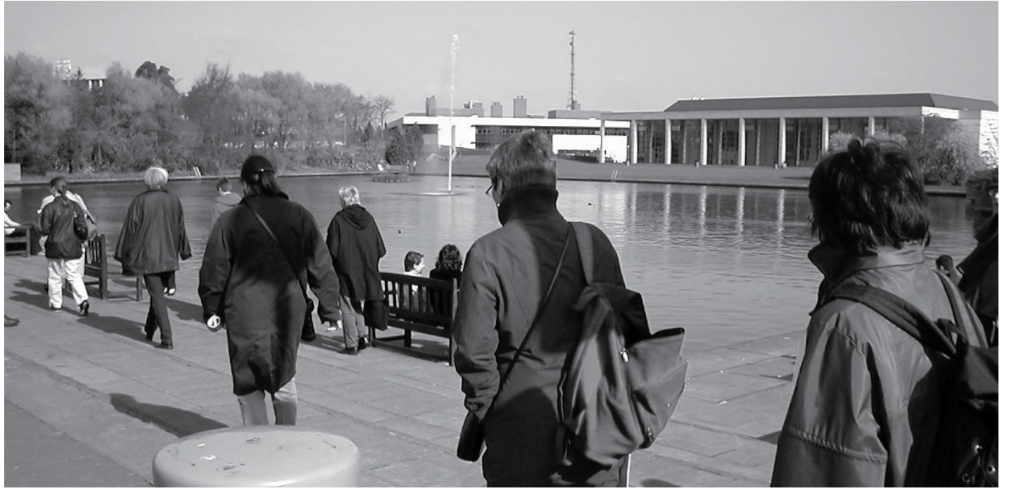
Above: UCD Campus Belfield Dublin

Like many other employers UCD has sought to save money in the last couple of decades by refusing to create permanent pensionable posts. Instead, a growing percentage of the workforce have been left on short-term contracts without any pension rights.