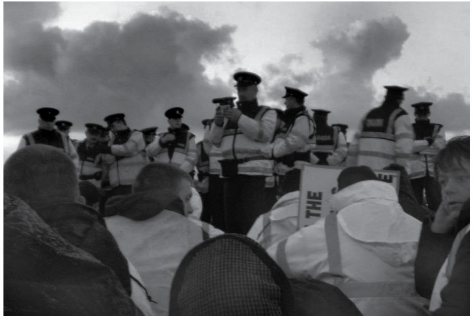
Above: Gardai film peaceful picketers in Rossport

Meanwhile, down in Limerick residents of Moyross have been subjected to intimidation, arson and shootouts between gangs of drug dealers. This has gone on for years. Has the government done anything to uphold 'law and order' there? Have they moved in hundreds of gardai to close down the gangs? Have they put in cash for education and jobs to provide a future for young people?