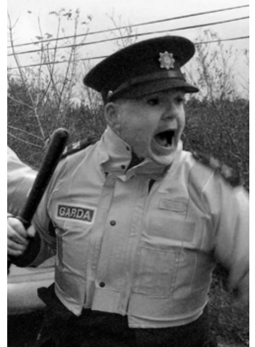
Above: A Garda draws his baton

The community is now aware of the state's potential to escalate the situation. They have learned this the hard way due to the Erris community's