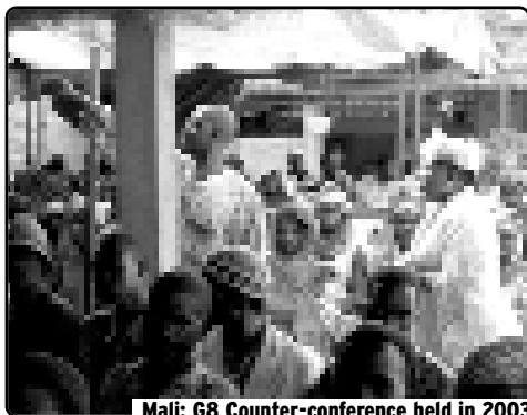
Mali: G8 Counter-conference held in 2003

"Any claim to tackle climate change whilst fighting wars for control of the planet's dwindling carbon-based energy reserves is as hypocritical as it is ridiculous. We reject any market-led techno-fixes to the climate crisis by an unelected global elite. Oil fuels capitalism - there cannot be an end to global warming without an end to the system that causes it. Nuclear power is not an alternative, as it is massively wasteful and inextricably linked to the most destructive weapons on the face of the earth. We believe that anti-capitalist