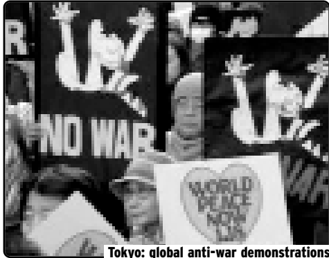
Tokyo: global anti-war demonstrations