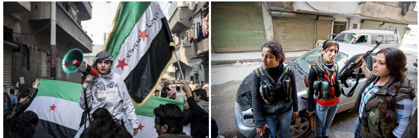
Left: Anti-Assad Protest in Aleppo, Syria. Right: Kurdish Militia Women in Struggle against Assad and the Salafi Jihadist Jabhat al-Nusra.