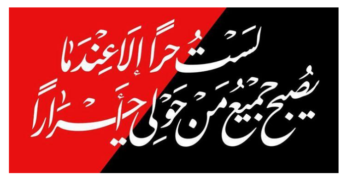
In light of this complex and rapidly developing situation, what position should anarchists take?

A. Our own view is that we should see the conflict in Syria as still being predominantly a popular revolution in which the majority of the Syrian people are fighting against an arbitrary dictatorship. The overthrow of that regime would be a victory for the Syrian people. It would also create a situation which, however temporary it might be, would give the Syrian workers and peasants, as well as consciously libertarian forces, the opportunity to pursue the struggle for real freedom. We advocate this position in spite of the fact that the United States and its allies in Western Europe and elsewhere have given diplomatic support, humanitarian aid, and now arms, to the rebels. While we never feel comfortable being on the same side as the United States, we do not see the rebels as mere proxies for the imperialists, under their control and dependent on them financially. Particularly because of the hesitancy of the US to get involved and despite the presence in their ranks of Syrian and foreign Islamic fundamentalist militias, the rebel armies still appear to be independent, popular forces and therefore worthy of support.