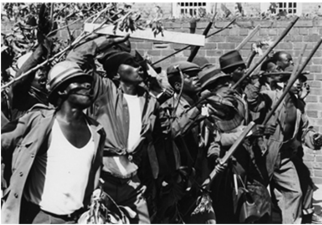
Municipal workers' march, 1973