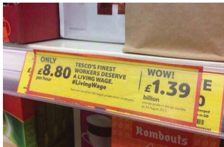
A protest stunt calling for wages of £8.80 an hour (the London living wage) for Tesco workers

2012, my manager told me that there were over 800 applications for 20 vacancies. We are all made to feel so grateful for these jobs so that we don't complain or cause trouble. Even the Usdaw union reps in many stores are afraid to stand up to management.