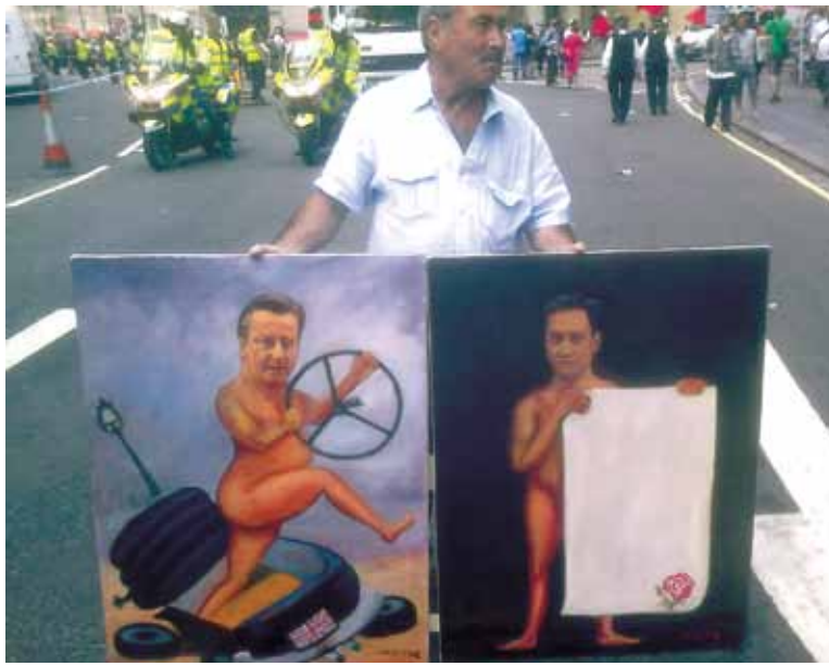
Inventive artwork on the anti-austerity demonstration

Miliband's failure to offer change appears to parallel the disastrous Kinnock leadership of the early 90s.