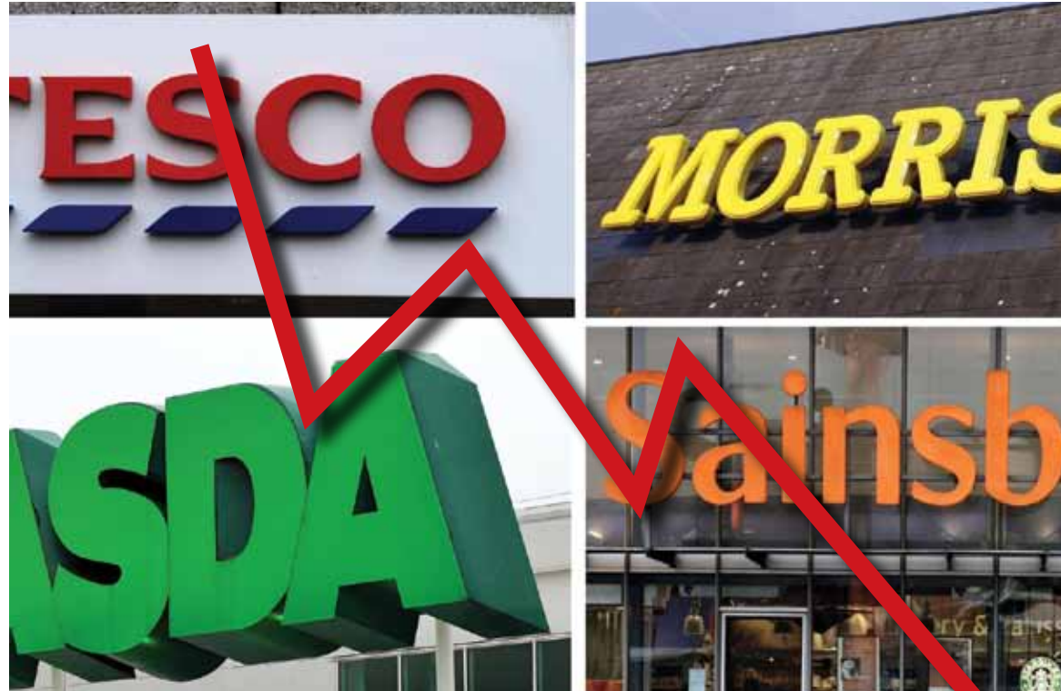
The big supermarket chains have announced drops in profits

Of course, employers are always out to maximise profit. So despite still being hugely profitable Tesco over the last two years has launched an assault on staff terms and condi-