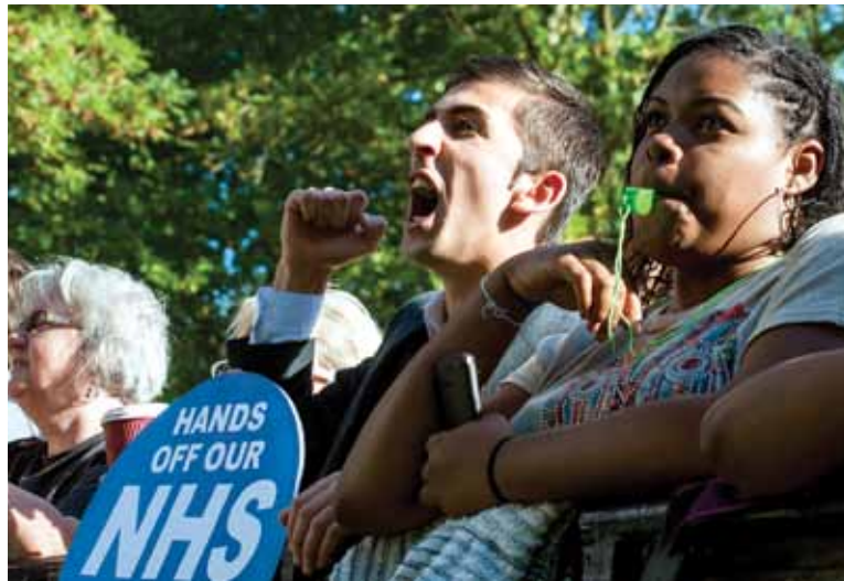
Cuts and privatisation are wrecking the NHS

The worrying thing is that for all its benefits, the NHS may not be around much longer. The so-called 'funding freeze' imposed by the government is in reality a year on year cut in spending, with staff being told to find first £20 billion then an additional £30 billion in 'savings' by 2020.