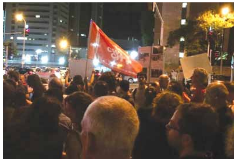
The protest against military escalation photos SSM

The attack was not aimed only at SSM but at any voice of criticism or opposition to the government action. It occurred on the background of incitement by government representatives and big parts of the pro-establishment media against anyone who dares to question the motives behind