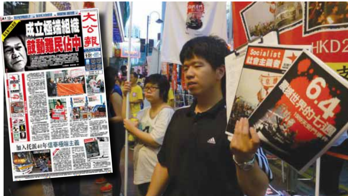
member on a demonstration and (inset) the Ta Kung Pao front page photo

Ta Kung Pao's concern over violence is worthy of an 'Oscar' given its silence over the military massacre of protesters in Tiananmen