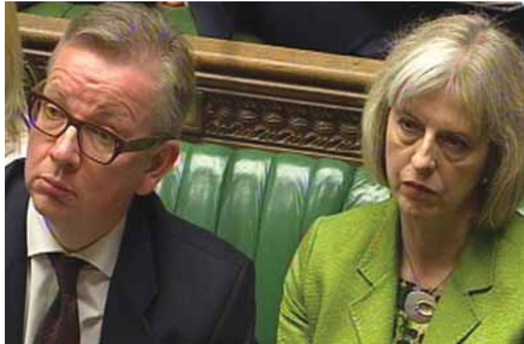
Michael Gove and Theresa May

The deployment of Ofsted, supposedly an independent body, has been used by Gove as a political