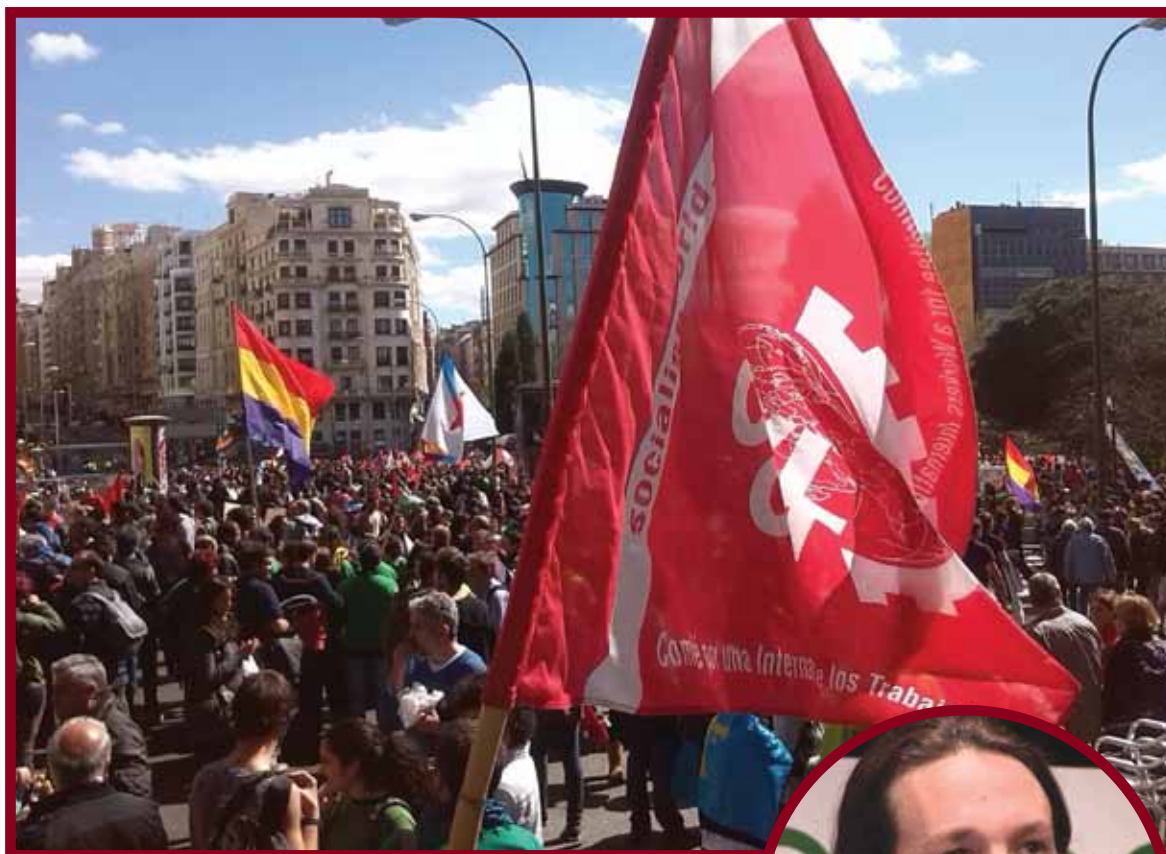
Above: CWI flag on one of the Marches for Dignity in Madrid in March

In the same way, one cannot in words oppose the 'dictatorship of the markets and the EU-IMF-ECB Troika' while at the same time putting forward a programme which