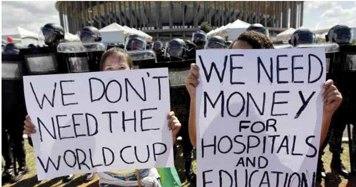
All the razzmatazz of the finals won't satisfy the social needs of Brazil's workers and poor