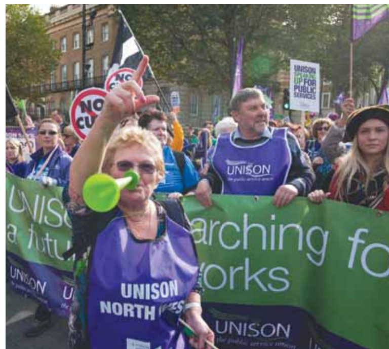
Unison members march against cuts October 2012

would have a national trade dispute and could have a national strike against cuts. This was ruled out of order as it was calling for 'illegal action'! When I then amended the position to say we should seek legal advice to see if it was possible, even this was ruled out.