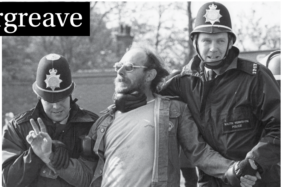
A defiant striking miner is arrested for 'unlawful assembly' at Orgreave