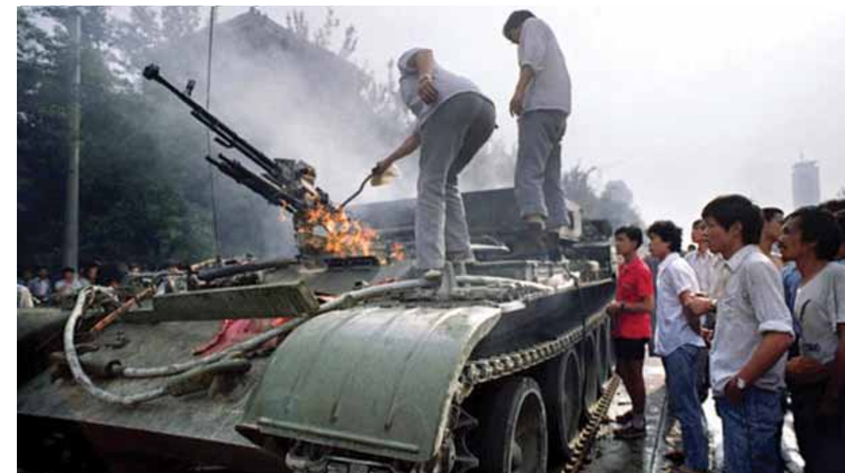
Demonstrators disable a tank sent by the Chinese 'communist' leadership to crush the protests

In so doing, these layers have moved further and further away from the actual tradition of struggle