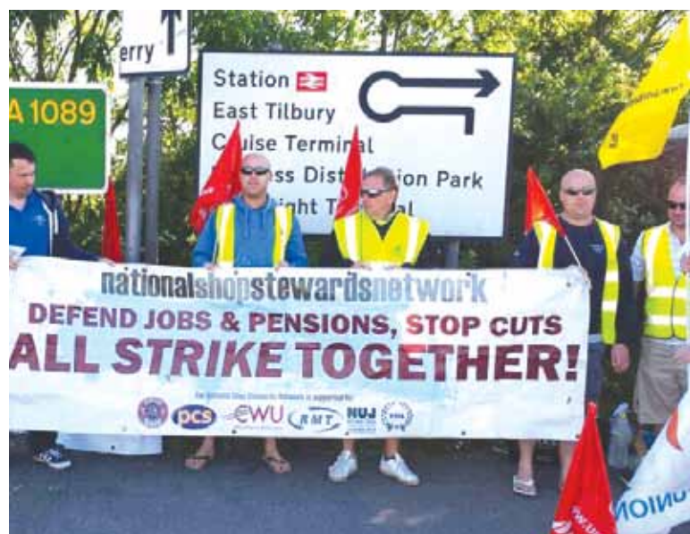
National Shop Stewards Network supporters travelled to Tilbury Docks in Essex to support an eleven-day strike by Unite members against employer SCA Logistics imposing zero-hour contracts. The strike started on 5 June.

• See www.socialistparty.org.uk for more workplace reports