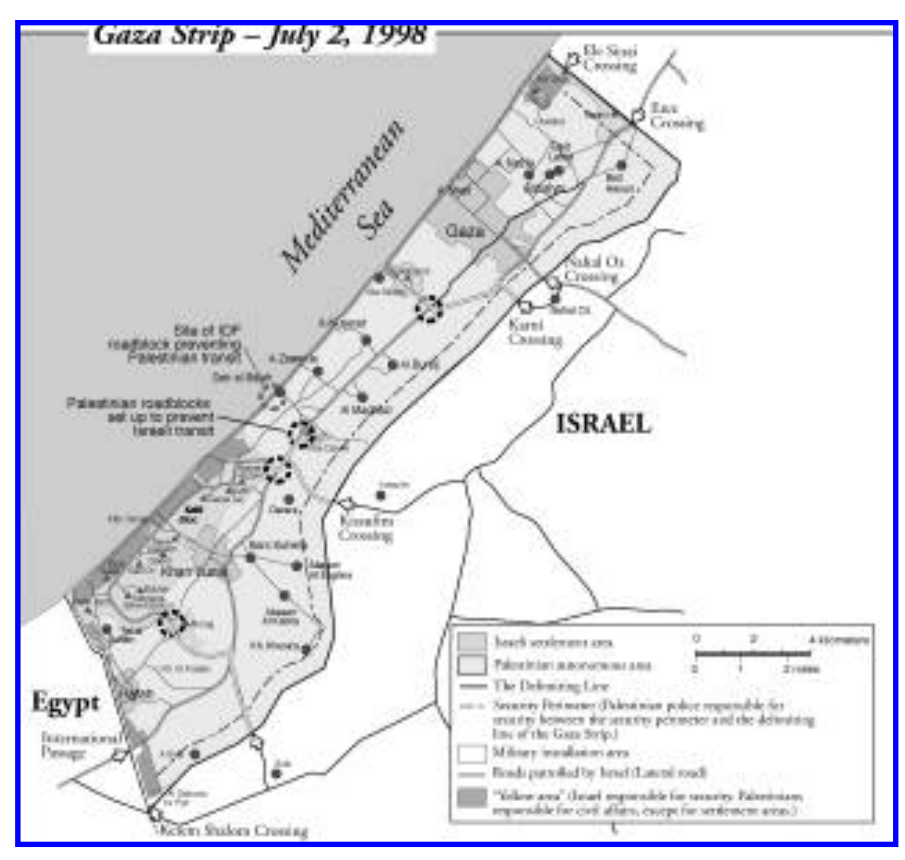
Figure 2. Map of the Gaza Strip as partitioned by the Gaza-Jericho agreement. From 1994 until 2005, Israel retained direct control over some 42 percent of the Strip, including settlements, military bases, bypass roads, "yellow areas," and a border security zone. (Foundation for Middle East Peace).

Closure in the Gaza Strip in recent years, and until disengagement, consisted of three layers. Externally, the territory was separated from Israel by a fence, built in the late 1990s, that has successfully prevented suicide attacks, <sup>10</sup> while Israel controlled the coastline and land border with Egypt. Internally, several "bypass" roads linking the settlements to Israel effectively bisected or at times trisected the Strip; these roads, only a few kilometers long and surveilled at virtually all points by heavily fortified observation posts, acted as physical barriers. Finally, the "yellow areas," inside the settlement blocs and largely cut off from the Palestinian urban centers, were home to several thousand Palestinians subjected to more intense and individualized measures of isolation, surveillance, and control. (See Figure 2.)