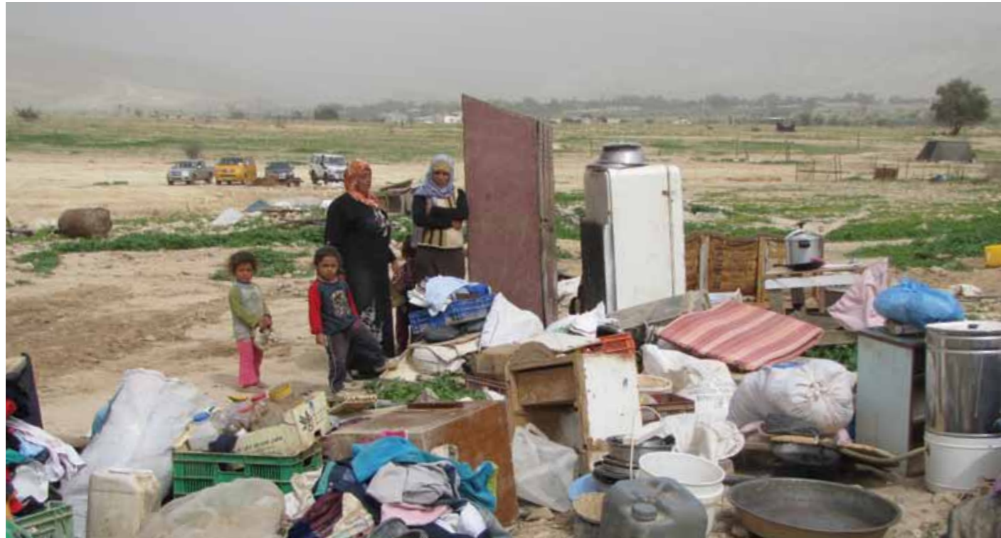
▲ Members of the a-Rashaydah family after the demolition of their home in Fasayil, the Jordan Valley.

The Israeli policy of building settlements in the occupied territory results in widespread human rights violations and undermines the development of Palestinian communities. Palestinian homes are demolished to make way for illegal settlements, displacing hundreds of people every year. Settlements deny Palestinians freedom of movement and deprive them from accessing vital resources such as water and farmland.