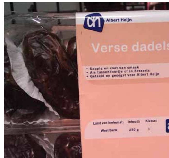
▲ Dates on sale in the Netherlands. The label reads "West Bank" which leaves the consumer unclear whether the fruits are from Israeli settlements or from Palestinian producers. After enquiry, the seller explained the dates were from Tomer settlement in the Jordan Valley.

The main Israeli exporter of dates is the company Hadiklaim. Hadiklaim appears to mark all dates as Israeli produce, making it difficult for the consumer to distinguish between dates from Israel proper and from the occupied Jordan Valley.