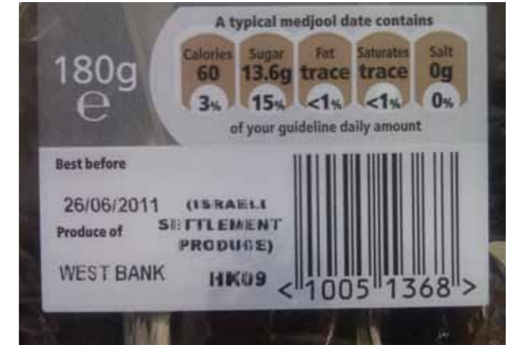
▲ Dates on sale in the UK. In accordance with the labelling guidelines introduced by the UK government in 2009, the label clearly states that it is “Israeli settlement produce”.

Danish FM Villy Søvndal announcing labeling guidelines. 147