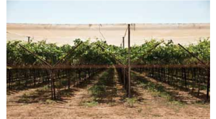
▲ Vineyards that form part of an illegal Israeli settlement in the Jordan Valley in the West Bank, built on confiscated Palestinian land.

Settlements have established modern agribusinesses and industrial zones that produce high value goods for export to the EU and international markets. This is partly due to the special incentives provided by the Israeli government.