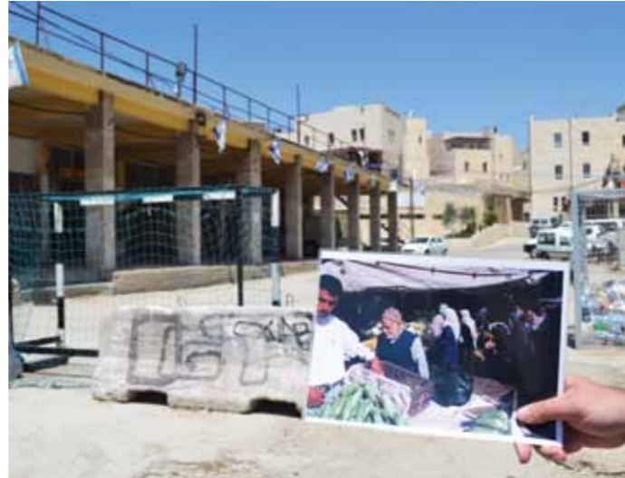
▲ A photo contrasts life in a busy Hebron market in 1999 and life on that street today. The old centre of Hebron has been closed to Palestinians, turning the city into a ghost town.

Obstacles to movement of goods: While settlers enjoy easy and direct access to Israeli and international markets, all Palestinian goods destined for Israel or further export must pass through Israeli checkpoints where they are unloaded from Palestinian vehicles and extensively checked before they can be re-loaded onto an Israeli vehicle on the other side (the so-called ‘back-to-back’ system). This is extremely time-consuming and often damages the products. Palestinian goods destined for international markets then pass through Israeli port and airport terminals where they face further disadvantages, obstacles and excessive time delays. All these obstacles significantly reduce the competitiveness of Palestinian products and increase the unpredictability of their delivery times and quality. 85