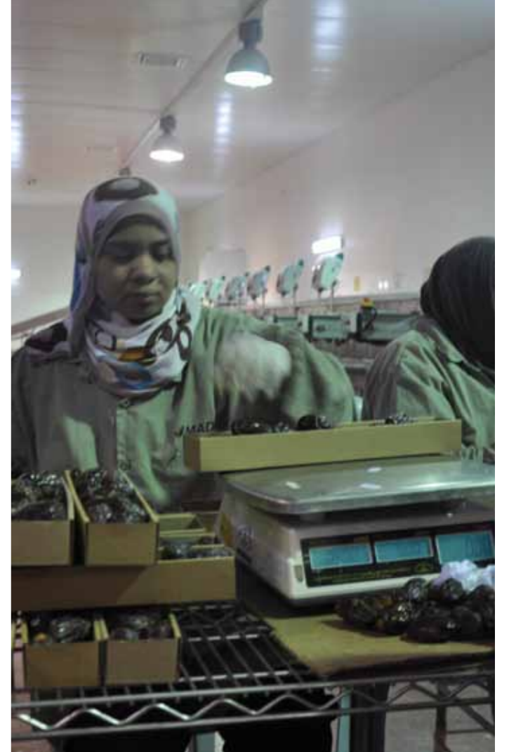
▲ Workers sort dates for export at Nakheel Palestine for Agricultural Investment.

With the goal of providing a solid alternative to employment on settlement farms, Nakheel Palestine currently employs 40 full time and 100 seasonal workers. With plans to plant an additional 24,000 date trees in the next two years, Al-Manasreh expects to triple its workforce.