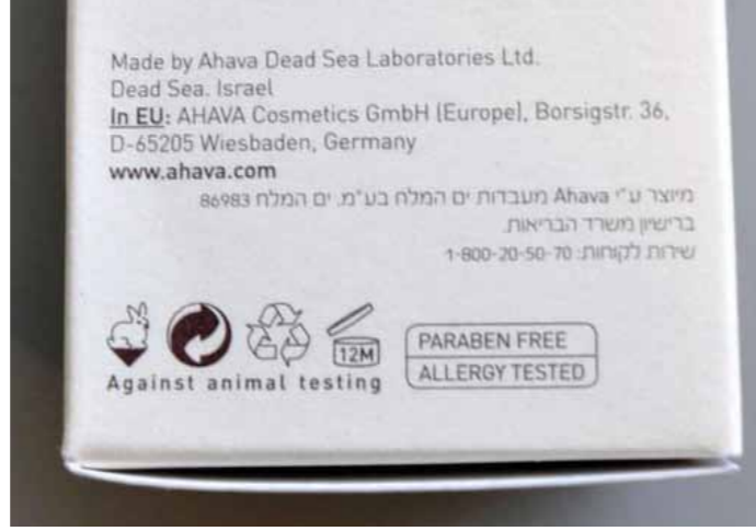
▲ The company Ahava labels their products “Made in Israel”, despite the fact that they are manufactured in a settlement in the occupied Palestinian territory. The postal Code 86983, shown in tiny characters on the packaging, is the postal code for the Israeli settlement Mitzpe Shalem by the Dead Sea.

SodaStream produces home devices for carbonation of water and soft drinks. SodaStream products, also known under the brand name Soda Club, are sold at more than 35,000 stores worldwide and 68% of sales are in Europe.