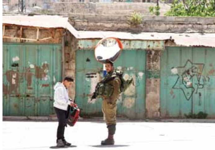
▲ Israeli soldier searches boy's school bag in Hebron.

Settlements are Israeli communities established on territory occupied by Israel since the 1967 Arab-Israeli war. Settlements are supported by an infrastructure including special roads, checkpoints, and the separation barrier dividing them from the surrounding Palestinian population. Settlements violate international law and UN Security Council resolutions and yet, throughout the 45 years of Israel's occupation of the Palestinian territory, every Israeli government has promoted continued settlement expansion.