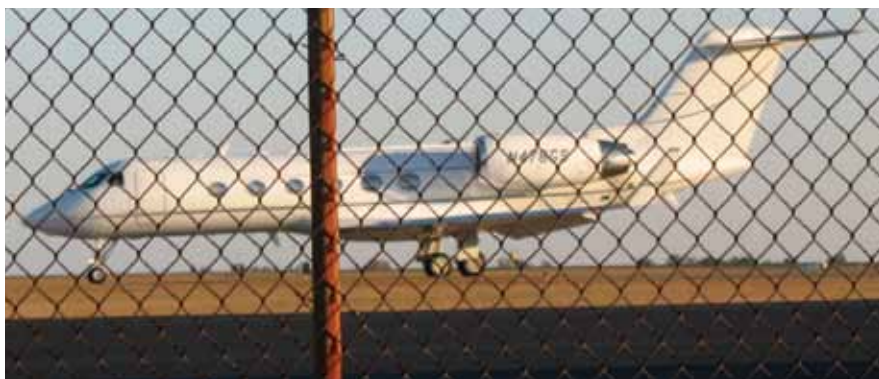
Suspect rendition aircraft N478GS which has stopped at Shannon many times.

According to Article 1 of the Chicago Convention, every State has complete and exclusive sovereignty over the airspace above its territory. Article 5 allows civil aircraft such as those not operating regular, scheduled services to fly over other States or to