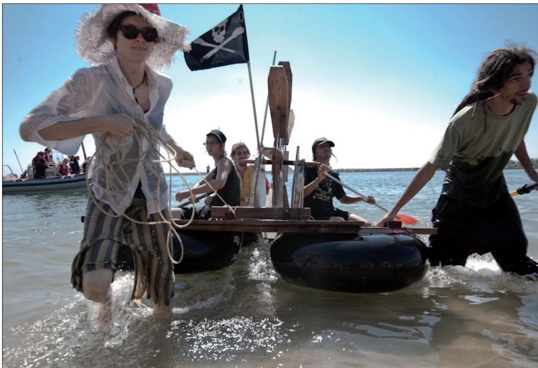
Shoring up the blockade at Newcastle Coalport, Australia

In early April Agenda 21 sabotaged a Norwegian whaling ship. Using the name of a 1992 United Nations Conference on the Environment, the group has promised Norway that if they did not comply with international conservation law, they would sink their whaling ships. This is the seventh Norwegian whaling vessel to come under attack since 1992. The head of a Norwegian whaling organisation complained "It is outrageous that this can be done year after year without anyone being caught."