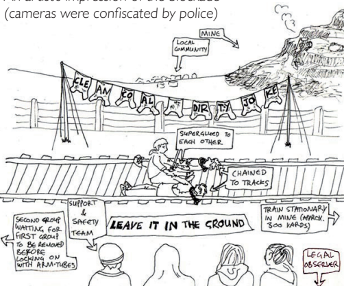
An artist's impression of the blockade (cameras were confiscated by police)

The activists reached the rail track at the mine at midday, and immediately phoned security to warn them about the protest. Three activists then used chains and padlocks to lock themselves to the train tracks. Two activists went to a nearby vantage point where they could warn any approaching trains. All of them were removed within four hours, but then a second wave of activists equipped with more heavy duty lock-on equipment attached themselves to the track, and took a further 4 hours to be removed.