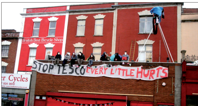
Protesters form lengthy queues to gain entry to Bristol's 32nd Tesco store.

before, two JCB diggers were wrenched open and wires ripped out, batteries were removed and sand poured into the engines. 3,000 litres of diesel were contaminated with what is thought to be sugar. Weeks earlier six acres of dune land caught fire from an abandoned barbecue. It is not known if this was an accident. Mr Trump is embroiled in a furious row with residents, some of whom are threatened with eviction if their homes are compulsorily purchased.