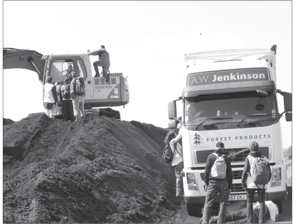
Workers at Chatmoss get bogged down by protestors

The destruction of peat bogs is not only a threat to local ecosystems but also massively contributes to climate change. Peat bogs act as huge 'carbon sponges': as peat is formed it locks away carbon that has been absorbed by plants as they grow, thereby helping to reduce the carbon in the atmosphere and slow global warming. The draining and extraction of this unique habitat causes the release of thousands of