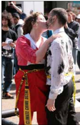
Tar sands protestors get dirty at the Tarmageddon protest in Oxford

trials which started in 2008, but the first year of a new trial that will continue until 2012. The Norwich trial would also run until 2012. It involves GM potatoes engineered to resist late potato blight. Both trials are experimental trials, and not part of an application to grow the potatoes on a commercial scale.