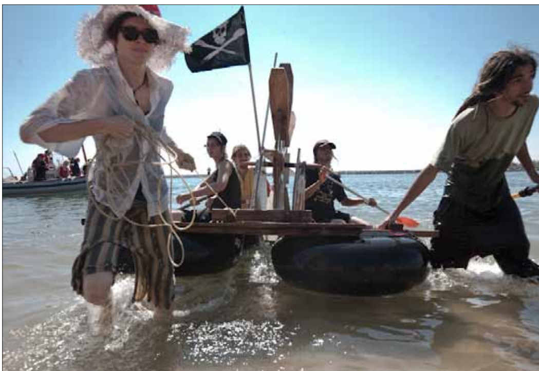
Shoring up the blockade at Newcastle Coalport, Australia

In early April Agenda 21 sabotaged a Norwegian whaling ship. Using the name of a 1992 United Nations Conference on the Environment, the group has promised Norway that if they did not comply with international conservation law, they would sink their whaling ships. This is the seventh Norwegian whaling vessel to come under attack since 1992. The head of a Norwegian whaling organisation complained "It is outrageous that this can be done year after year without anyone being caught."