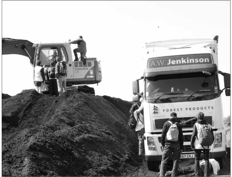
Workers at Chatmoss get bogged down by protestors

The destruction of peat bogs is not only a threat to local ecosystems but also massively contributes to climate change. Peat bogs act as huge 'carbon sponges': as peat is formed it locks away carbon that has been absorbed by plants as they grow, thereby helping to reduce the carbon in the atmosphere and slow global warming. The draining and extraction of this unique habitat causes the release of thousands of