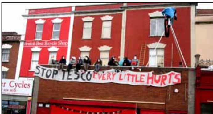
Protesters form lengthy queues to gain entry to Bristol's 32nd Tesco store.

before, two JCB diggers were wrenched open and wires ripped out, batteries were removed and sand poured into the engines. 3,000 litres of diesel were contaminated with what is thought to be sugar. Weeks earlier six acres of dune land caught fire from an abandoned barbecue. It is not known if this was an accident. Mr Trump is embroiled in a furious row with residents, some of whom are threatened with eviction if their homes are compulsorily purchased.