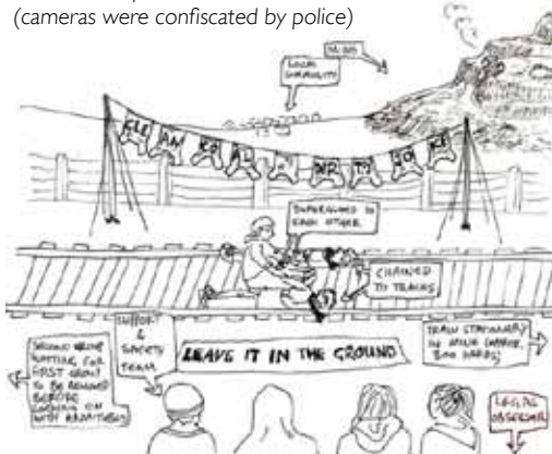
An artist's impression of the blockade (cameras were confiscated by police)

The activists reached the rail track at the mine at midday, and immediately phoned security to warn them about the protest. Three activists then used chains and padlocks to lock themselves to the train tracks. Two activists went to a nearby vantage point where they could warn any approaching trains. All of them were removed within four hours, but then a second wave of activists equipped with more heavy duty lock-on equipment attached themselves to the track, and took a further 4 hours to be removed.