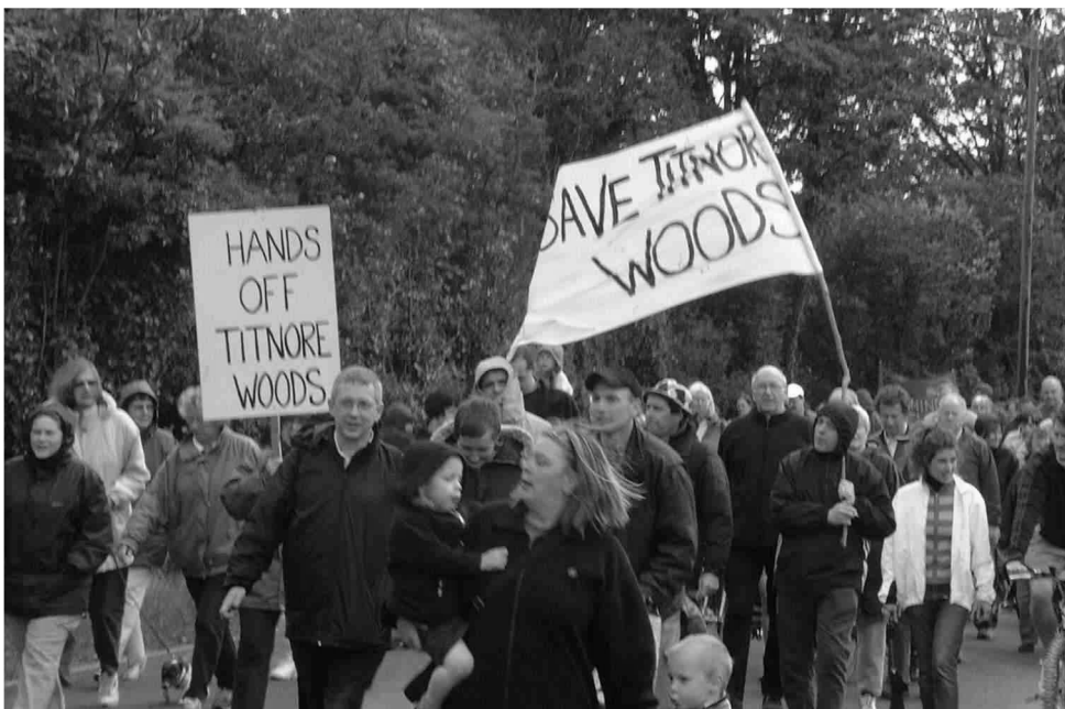
Titnore woods walk

Over a hundred people came together in June for the Outdoor Skillshare. Held at Talamh Housing Co-op in South Lanarkshire, the weekend aimed to bring people together to share the skills needed to occupy land and defend it from eviction. Workshops covered varied topics including cooking for the