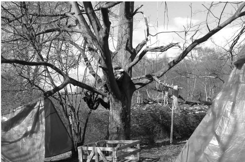
Defend Huntington Lane camp

The camp is coming in leaps and bounds, with new tree-houses appearing on both sites A & B, new tunnels going in and many new and returning faces appearing on site daily! The local community is very supportive: without their donations of food, water and materials we would have very little indeed. On the UK Coal front their shares are down and they have discovered hold ups. The local water pumping station is not sufficient to meet their demands (not surprising as it only supplies a tiny hamlet of less than 50 houses) so now they must pay for additional infrastructure. This will be expensive, figures on the grapevine range from £40,000 to £1,500,000! Another revelation came from a contact at the local council. In order to meet the demands put on the road by the additional HGV traffic, UK Coal must first make improvements to their only access road to the site. It seems that the council have