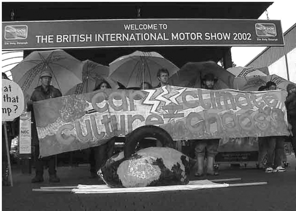
Car culture = Climate Chaos at the motor show

The 23rd was the open day for people (99% white males) from the trade and car industry. They were met by a loud and noisy demo organised by Birmingham Friends of the Earth outside the main entrance. The protesters, wearing wet weather gear marked with tyre tracks, brandished a model globe with a tyre track across it bearing the slogan "What was that Bump?" Two people from Rising Tide were stopped by security as they started to climb the 60 foot flagpoles outside the front of the show to unfurl a banner, and were escorted off the site. On this and subsequent days 3,500 leaflets denouncing car culture were handed out or left on car windows. A cycle-powered anti-car-show radio station by pir8radio broadcast throughout the protest and the following week. The repeating 20 minutes show contained interviews, climate news items, spoof adverts and jingles. See www.anticarshow.net or www.roadalert.org.uk for more info.