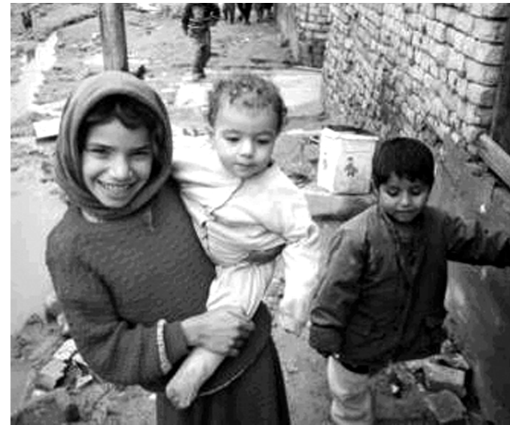
Life in Iraq - living in sewage

Humanitarian co-ordinators, resigned in protest at the sanction regimes, which they've called "failed" and "genocidal".