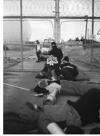
Locking-on at Menwith Hill

The action was a massive success. The main gate at Menwith is under construction so access is through two side