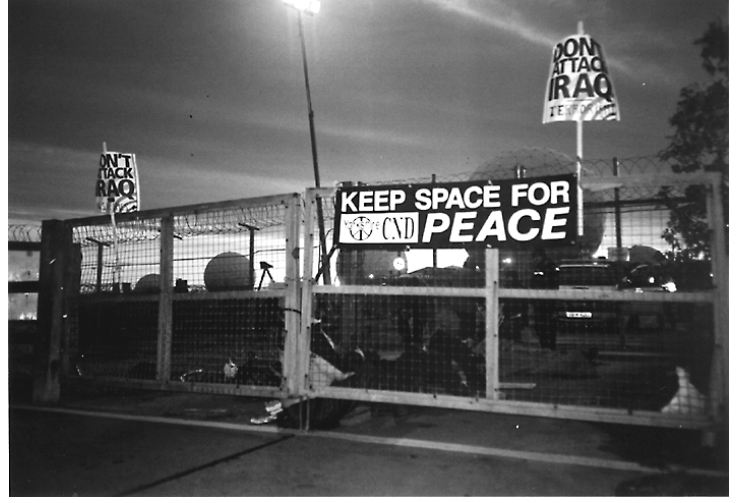
US spy base at Menwith Hill blockaded

Activists disrupted an army promotion and recruitment event at Horseguards Parade in London which also included the charity Stroke Awareness working closely on a joint scheme, using army fitness trainers to promote exercise. The activists "tried to point out what appears to be the contradiction in: 'Get fit and go kill people' – or - 'Get fit and go kill other people's children' - Or - 'Get fit then go and get killed'. 'Get fit then watch out for the Depleted Uranium' would have been even more to the point."