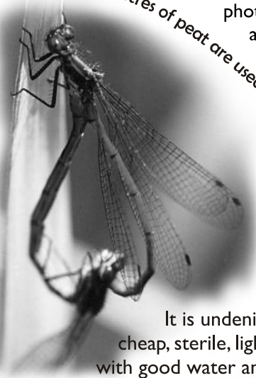
Large red damselflies, mating on a blade of grass