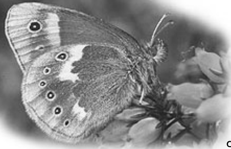
Large heath butterfly feeding on bog rosemary