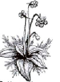
Butterwort, a rare carnivorous plant

The EF! Summer Gathering Write-Up will be appearing in the next issue of Action Update