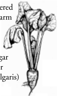
Beet, sugar & fodder (Beta vulgaris)

Planting March-April flowering shouldn't occur until 2nd Year, though GM varieties have shown a tendency to bolt