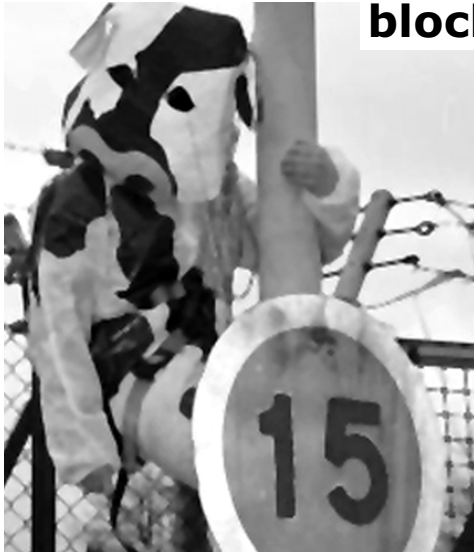
Cow scales lampost in Basingstoke

On Feb 22 nd five of supermarket chain Sainsbury's Regional Distribution Centres (RDCs) were simultaneously blockaded. The actions commenced at 10:30am blocking depots in Basingstoke, Hampshire; East Kilbride, near Glasgow; Elstree, North London; Maidstone, Kent and Stone, Staffordshire.