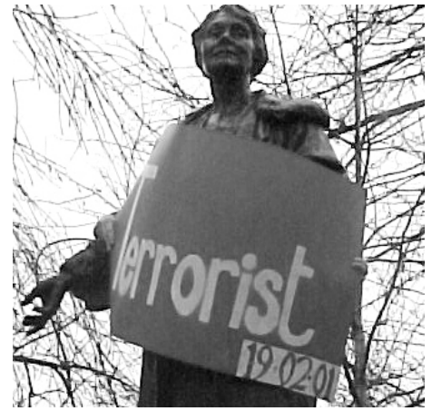
Statue of Emily Pankhurst, London

On Feb 19 th the New Terrorism Bill was enacted. The Act brings much of the Northern Ireland 'emergency' legislation into mainland UK law and broadens the definition of potential terrorist acts to include damage to property.