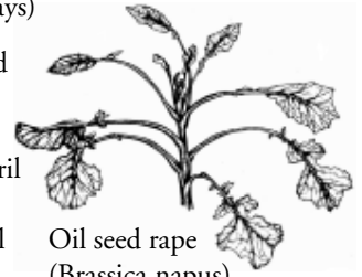
Oil seed rape (Brassica napus)

Winter sown Oct/Nov flowering end March/April Harvest July/Sept Spring sown March/April flowering June