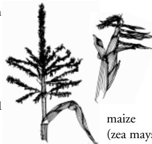
maize (zea mays)