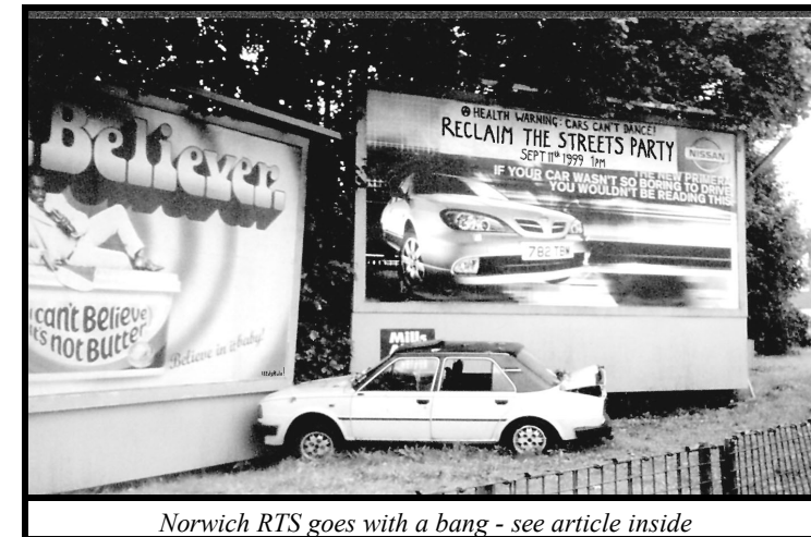
Norwich RTS goes with a bang - see article inside

Earth First! is not a cohesive group or campaign, but a convenient banner for people who share similar philosophies to work under. The general principles behind the name are non-hierarchical organisation and the use of direct action to confront, stop and eventually reverse the forces that are responsible for the destruction of the Earth and its inhabitants.