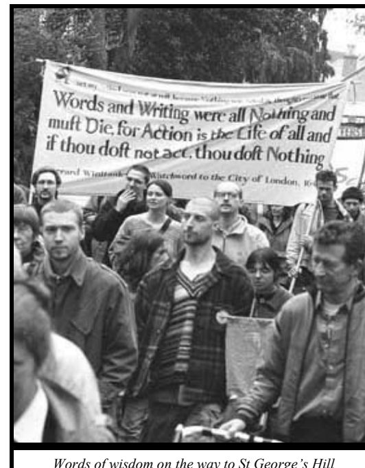
Words of wisdom on the way to St George's Hill

April 19th was another date in the long list of Monsanto's PR balls-ups when their attempt to extend their injunction against the Snowball campaign was rejected by the jury in the London trial. The injunction, if granted, would have prohibited any person who had ever ordered a Snowball handbook to go near any of their fields. The handbook can now be downloaded from the web address http://www.gn.apc.org/pmhp/dc/