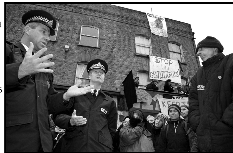
The first failed attempt by police to evict the barricaded 121 Centre

The Action Update is a monthly roundup of ecological direct action news and forthcoming events in Britain. Feature articles inside: Local Networking Initiatives. Conflict Resolution and EF! National Campaign (feedback from Winter Moot)