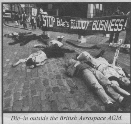
Die-in outside the British Aerospace AGM.

After this there was a rush at the stage as other activists attempted to mount the podium and meet the board. Some eggs were thrown and two people locked on. Security waded in and began to remove people. There were reports of heavy-handed treatment including activists being beaten up in the lift. Activists were also photographed by Security. Contact CAAT 0171 281 0297.