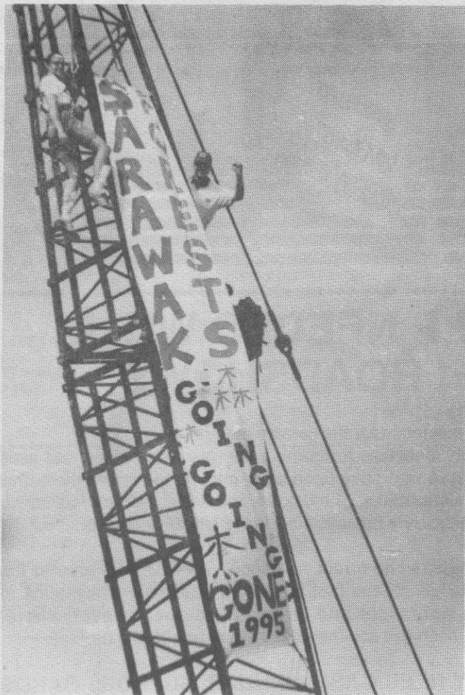
A banner is hung from a loaded timber barge in Sarawak.

Activists were joined by Swiss activist Bruno Manser and David Bellamy at protests during the G7 economic summit.