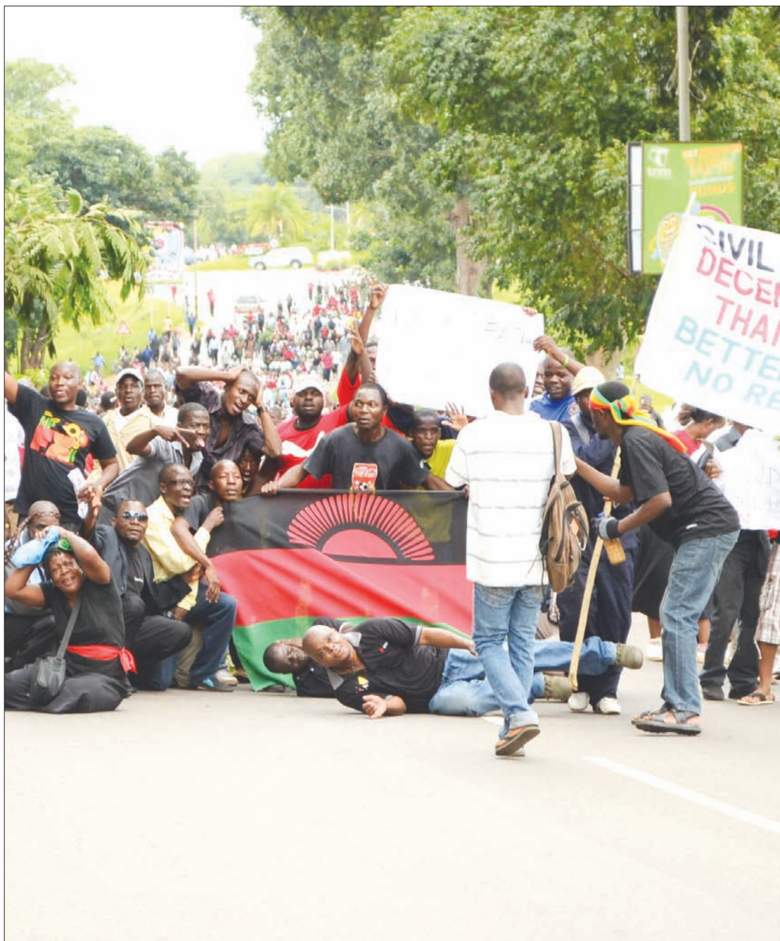
One of the recent civil service industrial actions in Lilongwe

The 1880s USA looked like China today: massive factories, poverty, slums, and the oppressed working class under the boots of the powerful, wealthy elite. Anarchist workers fought back. They were central to the US-wide general strike of May 1 1886, involving 300 000 workers. Unions demanded the eight-