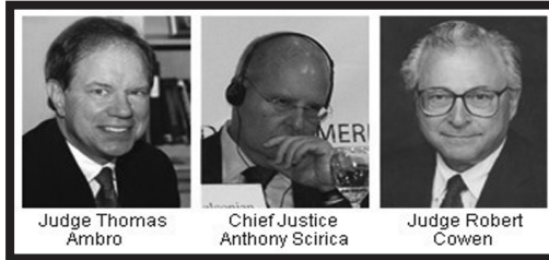
Judge Thomas Ambro

(Read more about Ambro's dissent at EmajOnline.com)