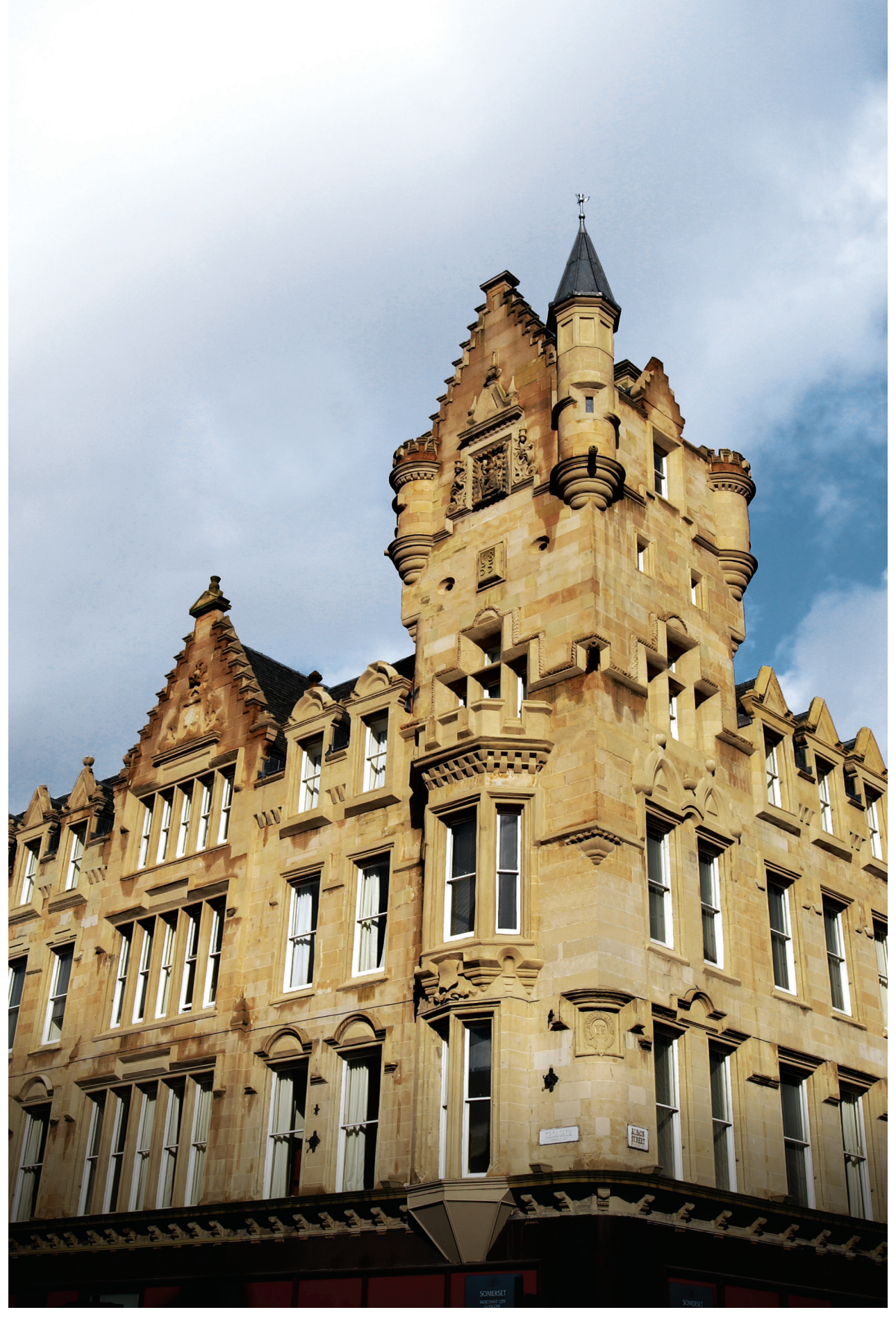
Fraser Suites Glasgow, UK.