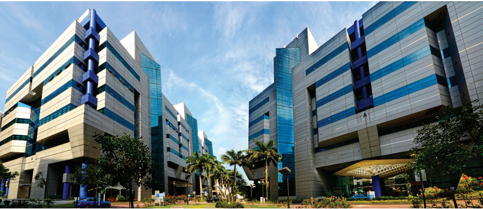
Alexandra Technopark, Singapore.