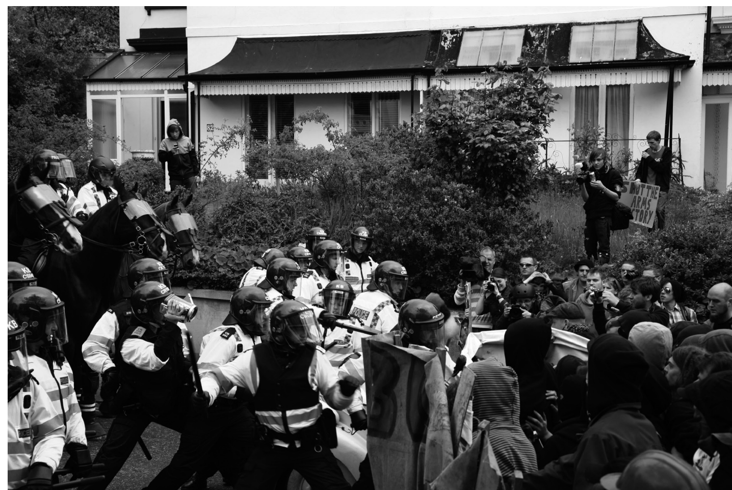
May Day anti-EDO protest in Brighton