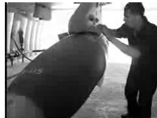
Israeli F16 bomb rack being armed