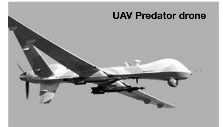
UAV Predator drone

In January 2009, during the bombing of Gaza, the Green Party forwarded another motion to the council condemning EDO's role in manufacturing components used by the Israelis. On 17th January 2009 the motion was erased from the council meeting's agenda on the basis that the Conservatives did not think the issue was 'relevant' to the public in Brighton and Hove. The same evening the six decommissioners broke into EDO MBM/ITT.