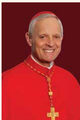
Donald Cardinal Wuerl Arzobispo de Washington